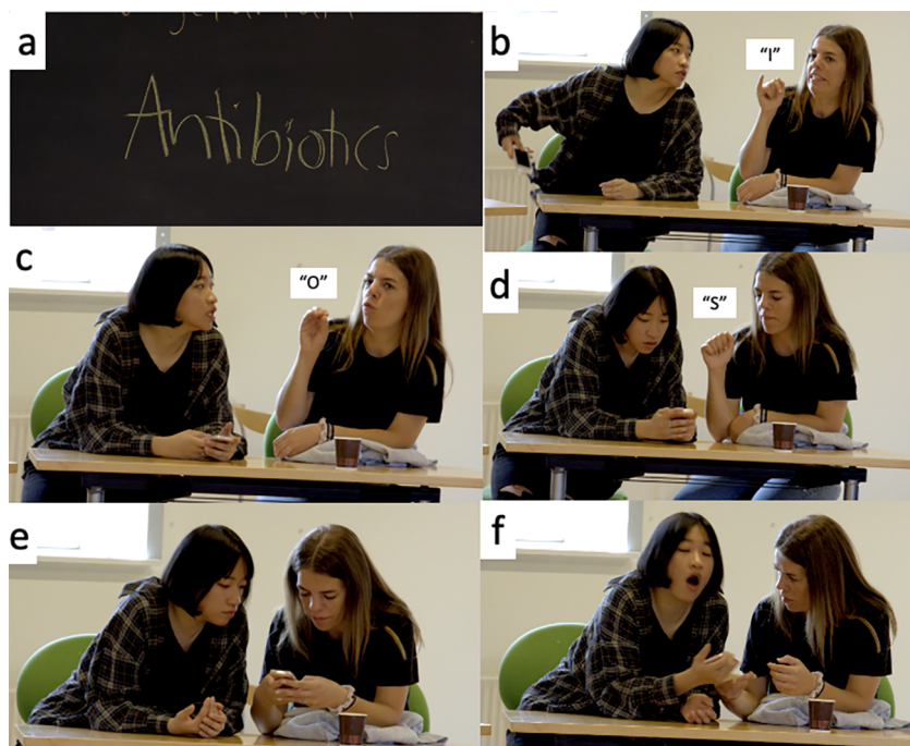
Figure 3. Screenshots from the film This Is IS , episode 1 ( https://vimeo.com/686852215#t=25m17s )