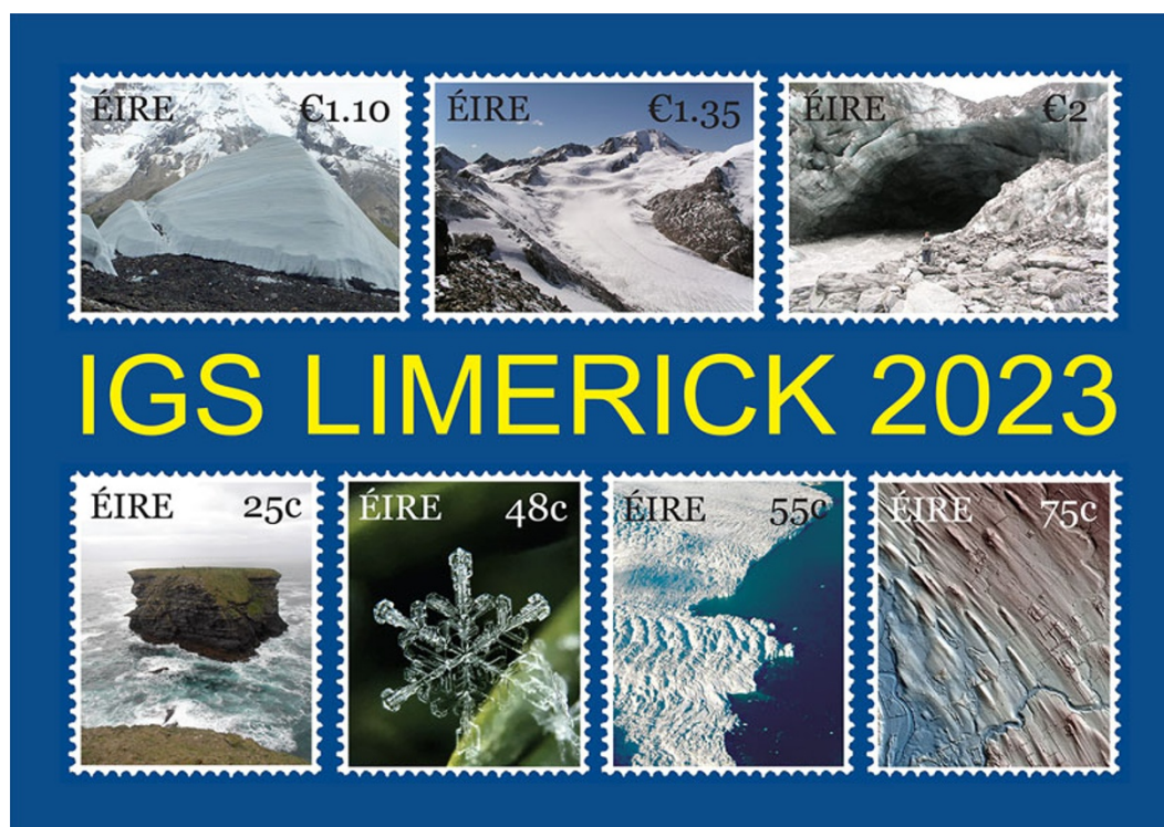
Figure 2. Felix's poster for the conference; €1.10: ice sail on Baltoro Glacier (A. Lambrecht); €1.35: Hintereisferner; €2: Franz Josef Glacier; 25c: Bishop's Island (all A. Fowler); 48c: snow flake (A. Burden); 55c: Sveabreen (A. Chapuis); 75c: DEM of drumlins in the Scottish Borders (C. Clark).