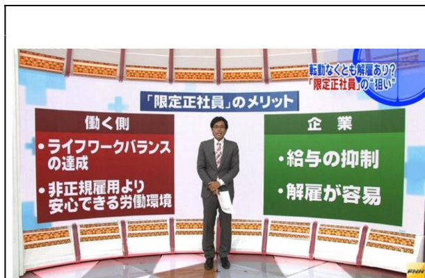
A television news show presents the conflicting aims of limited regular employment for labor and capital. For workers: achievement of work-life balance and more reliable labor environment than non-regular employment. For companies: ability to hold down wage costs and dismiss workers more easily.