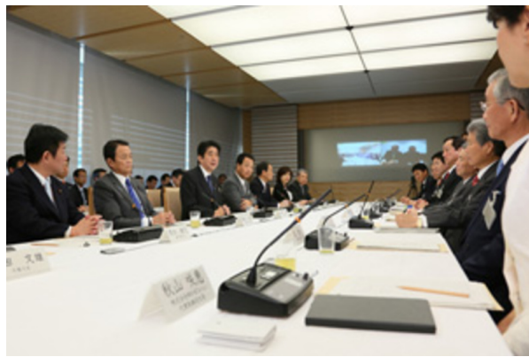
The Abe cabinet discusses growth strategy

and underpay and poor career possibilities for non-regulars, who get less respect and may receive less than a living wage for a nearly 40-hour workweek. The relative poverty of the working poor is linked to delays in marriage and consequent birthrate declines. This growing imbalance in (and between) the lives of regular “core” and non-regular “peripheral” workers is starting to threaten social reproduction and Japan’s long-term social stability.