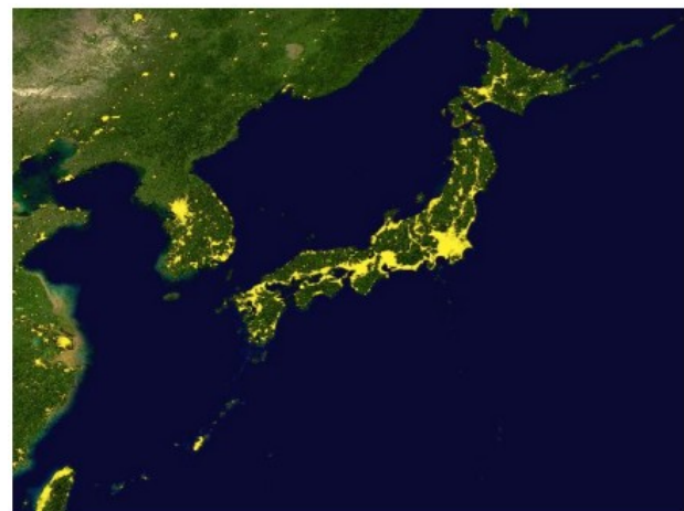
Fig. 3. Nighttime satellite image of Japan's lights superimposed on a daylight satellite image of the archipelago and its eastern neighbors.

Vaclav Smil is Distinguished Professor, University of Manitoba, Canada. His interdisciplinary research has roamed