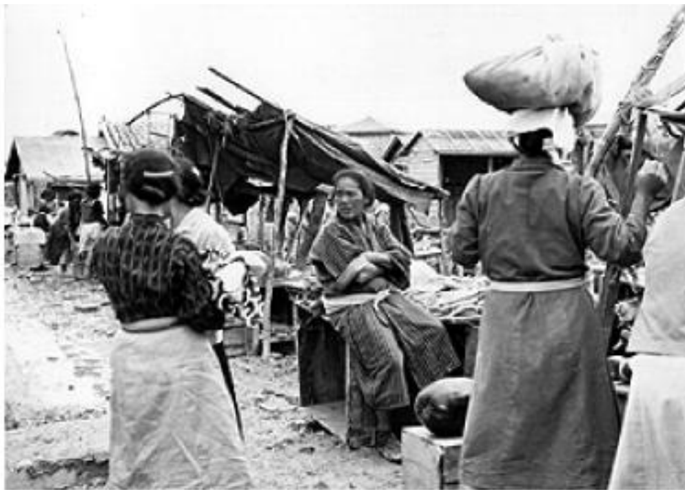
Figure 3. Black Market Scene in Naha, Okinawa, circa 1948

kinship networks. Okinawan employees at military bases often shared their hard-won senka with their friends and family, but they sold the bulk of their goods to black market brokers who traded them with other smuggled commodities for a profit. A popular Ryukyuan poem captures the distribution of labor in this underground trade, reflecting social conditions in Okinawa at the time: “best pickings at the top, black markets in the middle, we at the bottom must win senka .” In other words, the upper class clung to the US military for access to power and prestige, the middle class could secure a decent living by trading black market goods, so the lower class was left to fend for themselves in pursuit of senka . 32 In general, most of the senka was supplied by those who worked inside or lived nearby the major military bases in central Okinawa, then flowed into the thriving black markets in southern Okinawa. The emergence of new social classes in postwar Okinawa thus developed simultaneously with the geographical distribution of the US military bases and black markets.