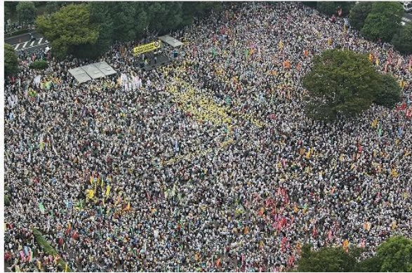
Demonstration in Meiji Park, Tokyo, 19 September 2011

Shimbun. 29 NHK could more often than not be bothered to send a camera to Yoyogi Park, a stone's throw away, to interview protestors there.