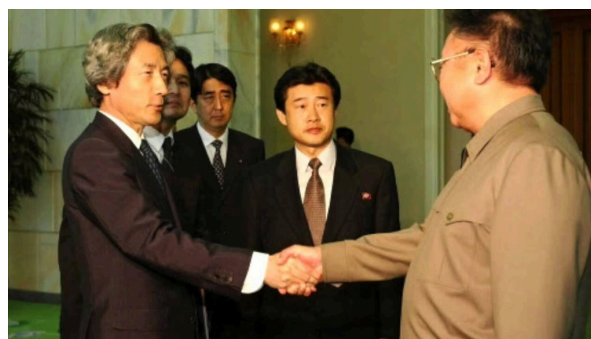
PM Koizumi Junichiro meeting Kim Jong-il, September 2002

based reporter from the 15 European Union member nations was allowed to accompany him. During the investigation into the 2000 murder of British hostess Lucie Blackman, foreign reporters were barred from police press conferences. 15 Both incidents were cited in a landmark European Commission report in 2002, which criticized the press club system for impeding reporting “of events of widespread international interest and significance.” 16