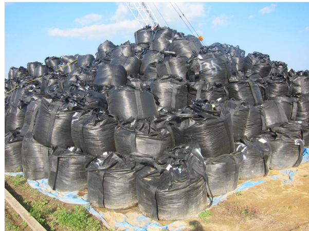
Dump of contaminated soil, Fukushima