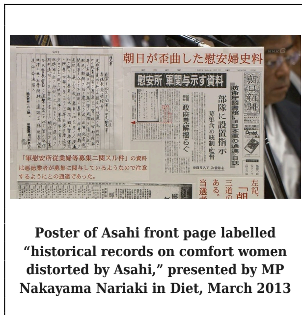
Poster of Asahi front page labelled "historical records on comfort women distorted by Asahi," presented by MP Nakayama Nariaki in Diet, March 2013

cleared up the controversy but the Asahi relied on its in-house Press and Human Rights Committee to probe the story and discipline those behind it. "In Japan, there is no such press council or professional organization in place to support journalists such as there would be in the US, for example," lamented journalist Kamata Satoshi of the newspaper's conduct. "The press club system is completely obstructing the development of professionalism within Japanese journalism." 41