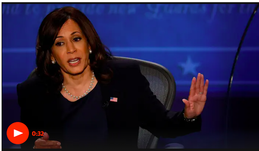
Figure 1. Kamala Harris: “Mr. Vice President, I’m speaking”