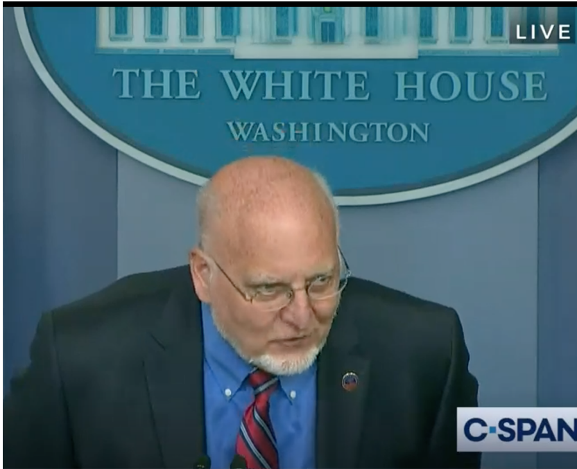
Figure 5. Robert Redfield bowing toward the press as he acknowledges he had not been misquoted.

Eventually, Redfield gave in and slightly bowing toward the journalist (fig. 5) had to admit that he had not been misquoted: “I’m accurately quoted in the Washington Post as ‘difficult.’” But he insisted in adding that: “the headline was inappropriate.”