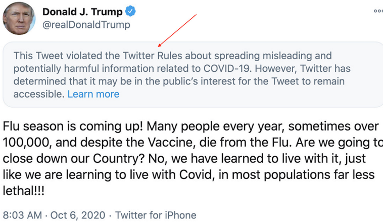
Figure 3. Twitter’s reaction to Trump’s tweet about COVID-19’s mild lethality.

A few months later, in early October 2020, a similar type of flagging was applied to a tweet (fig. 3) in which President Trump, while still recovering from COVID-19 one day after being discharged from the hospital, had downplayed the dangers of the coronavirus pandemic. 8 Unsurprisingly, the measure triggered a flurry of enraged tweets against “Fake News CNN and the Amazon Washington Post” by Trump and his supporters. However, while the public commentary about this mediatic dispute focused almost exclusively on issues of free speech, other aspects of the controversy remained relatively overlooked. For example, Trump’s use of his own healing body as evidence of the truth value of his claim about the allegedly mild risks of the virus epitomizes evidentiary regimes pivoting on notions of transparency and accountability and common to both populist and neoliberal democratic ideologies (Strathern 2000; West and Sanders 2003). Further, by using his body to corroborate his own medical theory, Trump positions himself as the ultimate locus of truth and promotes a “populist epistemology” characterized by the rejection of scientific knowledge and the proclamation of a highly personalist theory of meaning, which views meaning “as owned by the individual speaker and exclusively defined by his intentions” (Duranti 1988, 13; see also Rosaldo 1981; Hill 2000). 9