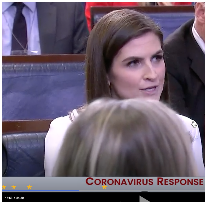
Figure 6. Reporter Kaitlan Collins: “Do you want to revisit that statement?”.

Trump: No, that’s not under control for any place in the world. . . . (TC 17:28)