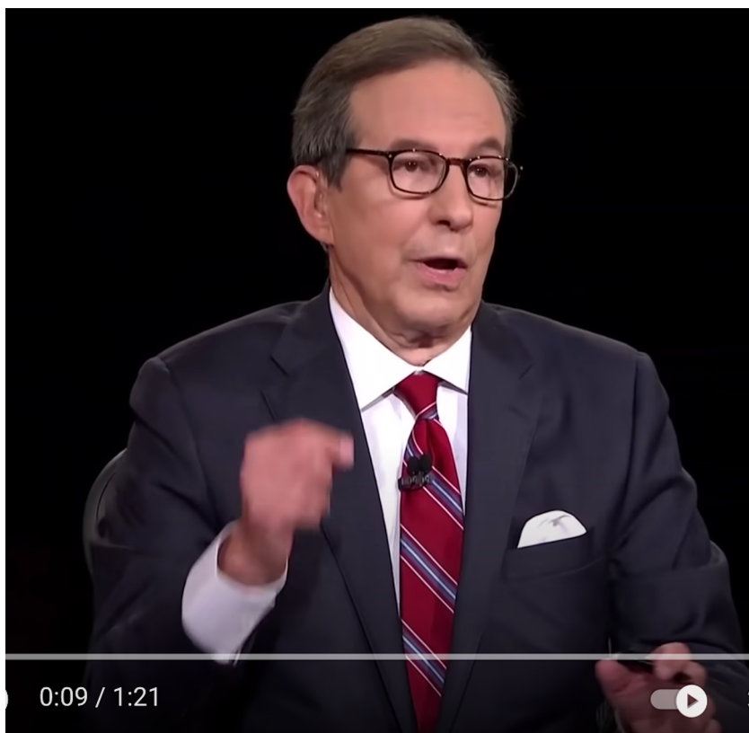
Figure 4. Chris Wallace: "Are you willing to condemn?" (screenshot by the author)

Wallace thus explicitly tries (lines 3 and 7) to engage President Trump in an unequivocal expression of moral and political disapproval of the actions (and presumably the ideas) of the white supremacist groups who constitute part of his base. The prosody of Wallace's speech is characterized by shifts in volume and intonation and meaningful pauses as a way to invite Trump to provide a definitive answer to the question (fig. 4). But once again, after expressing twice his alleged willingness to discredit white supremacist groups (lines 4 and 6), Trump backs off: