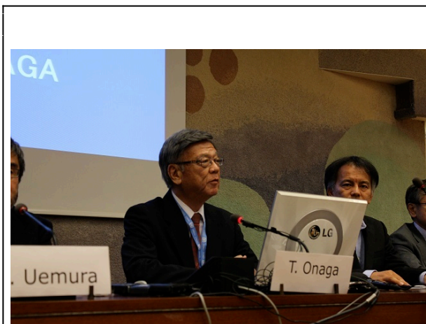
Governor Onaga addressing the United Nations, © Hideki Yoshikawa

latest move can also be understood as a manifestation of the Onaga administration's frustration with the fact that, while stressing the importance of the U.S.-Japan Security Treaty, most governors of Japan's other prefectures are unwilling to host (or even discuss hosting) U.S. military bases or training in their prefectures. In other words, they persist in "free riding" on the US-Japan Security Treaty at Okinawa's expense. 24 The Onaga administration's alternative plan likely incorporates the recommendation laid out by the Tokyo and Washington-based think-tank, "New Diplomacy Initiative," which calls for development of a "new rotational system" for the U.S. Marine Corps stationed in the Pacific. 25 Apparently, the Onaga administration is contemplating presenting its alternative plan during Governor Onaga's visit to Washington D.C. in March 2018.