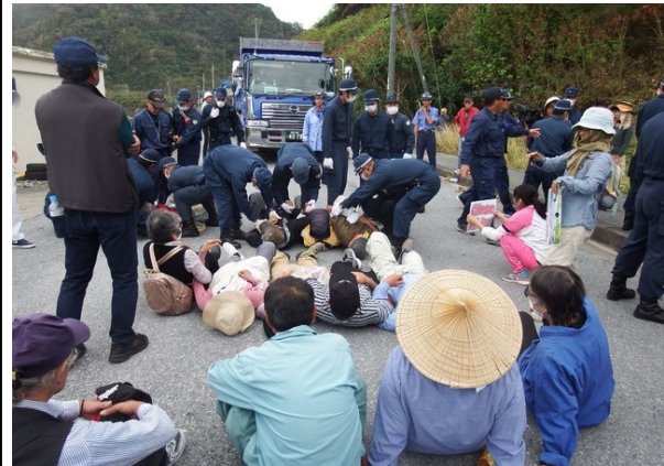
Protesters at Oku Port

On the other hand, a growing number of people feel angry and betrayed. Many now question whether Governor Onaga and his government are sincere and serious about stopping the base construction. These reactions are evident especially among protesters who are already weary from daily protests, continuing now for years, at Camp Schwab and Henoko-Oura Bay, as they now have to head off also to the distant port of Oku.