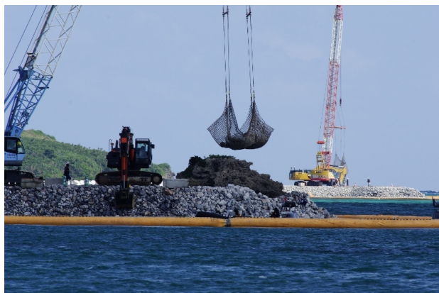
K-1 and N-5 Seawall Construction, © Yamamoto Hideo

Governor Onaga also claimed that the permit, issued under the Port and Harbor Act, pertained only to the keeping of landfill materials and the berthing of ships at the port, not to transport of landfill materials from the port by sea. He stressed that for transport by sea from the port of such landfill materials, the companies and the Okinawa Defense Bureau should have applied for a separate permit under the Land Reclamation Act, indicating that the Bureau and companies were in breach of the Act. On November 15, the same day Governor Onaga held a press conference, his administration sent a letter to the Bureau requesting it to stop transporting landfill materials by sea.