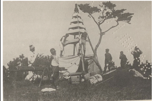
Figure 2. Surveyors constructing a signal pole atop a Korean peak.

In order to connect the geodetic triangulation of Japan proper with that of Korea, based upon the selection of principal points of triangulation in Tsushima island, Japan proper, the longitude and latitude of Zetsuyei (Chyolyong) island (near Fusan ) and Kyosai (Kō-jyō) island (near Masan ) in the extreme South of the Peninsula, and the distance between the two islands were surveyed (GGK 1911 43).