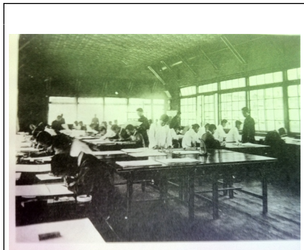
Figure 4. Employees of the Land Survey Bureau hard at work.

It goes without saying that the process described above was heavy on computation. Indeed, whatever the sophistication of the tools and techniques employed by the surveyors, their maps were only as good as the trigonometric computations made by the mapmaker, which were nothing if not voluminous. The principal challenge lay in translating data points into a map projection. As data poured into the processing centers (see figure 4), a cadre of employees worked to sort out this data in a timely and fluid fashion. Although Korean employees were more often tasked with filing the cadastral registers, they also contributed to the calculation component of the triangulation project, mostly as clerks. In the early stages of this operation, the draftsmen and professional cartographers were, with a few exceptions, Japanese.