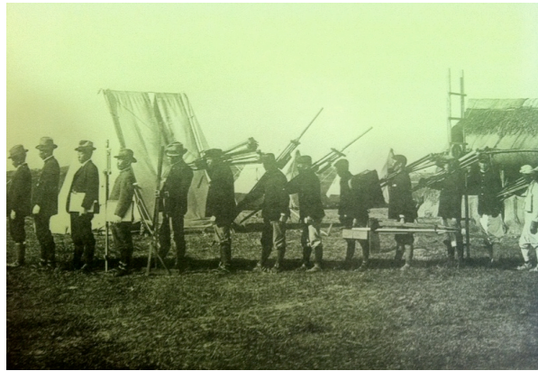
Figure 1. A surveying party gearing up for a day of fieldwork.

Shortly after annexation in August 1910, the government-general commenced the land survey. The work of the survey was handed over to the newly established Provisional Land Survey Bureau of the government-general, which assumed all responsibility for its operations. The official regulations of the land survey were set forth in Imperial Ordinance No. 361, codified in September 1910, just weeks after the Treaty of Annexation was inked. “A complete land survey of Korea,” stated a government-general report from 1910, “is of great importance in order to secure justice and equity in the levying of the land tax, and for accurately determining the cadastre of each region as well as protecting rights of ownership and thereby facilitating transactions of sale, purchase or other transfers. Otherwise, the productive power of land in the Peninsula can not be developed” (Government-General of Korea [hereafter GKG] 1911, 40). For the government-general, the land survey was thus the key to unleashing the productive power of Korean soil, and standardized maps—those that fashioned order out of perceived chaos (Scott 1999)—were the canvas upon which a new, rational, and productive Korea would be drawn.