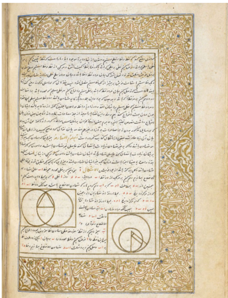
Figure 1. A miscellany written for Jalal al-Din Iskandar ibn 'Umar Shaykh, © British Library Board, Add. MS. 27261, f.343v.

compiler that materializes imperial desires and claims the poem, silently co-opting through allegory the positions of Justice and Fortune.