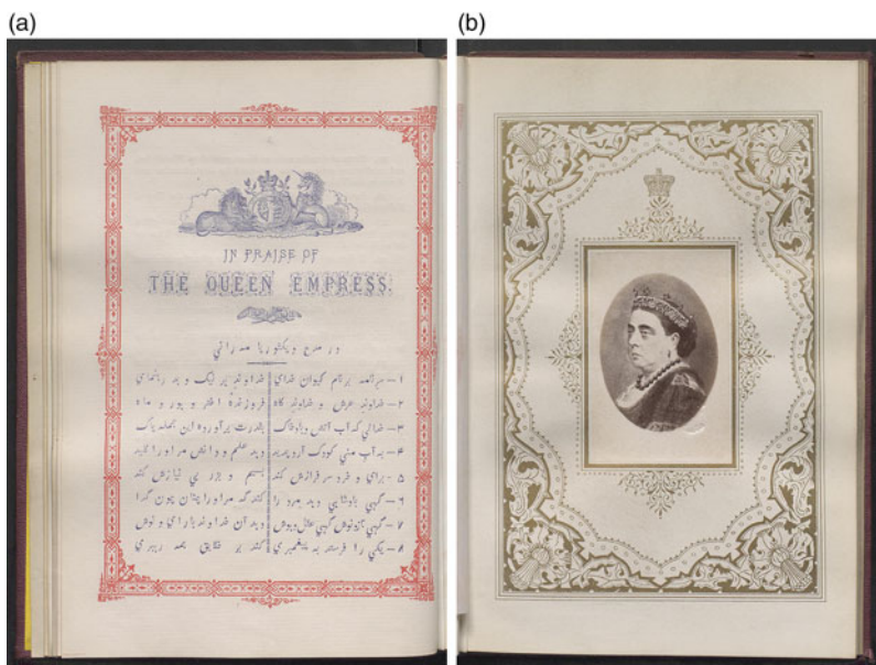
Figure 3. Sohrabji Kuvarji Jivaji Taskar, Persian Poems , Bombay: Education Society Press, Byculla, 1881, Shelfmark: Asia, Pacific & Africa 757.i.43, p. 6, and inserted portrait of Queen Victoria.

circle of allies: the first poem, written to commemorate the Parsi new year, draws the addressees into the cosmic plan of the Zoroastrian “Creator,” who granted “us, of the Kayanian race, joy, ease and comfort.” 43 The poem “In Praise of the Queen Empress (در مدح ویکتوریا مه رانی)” comes next, with a rather grave looking portrait of its subject (Fig. 3).