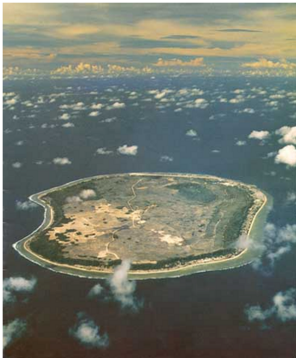
Nauru from the air

On 22 August 1942, eighteen Japanese planes bombed Nauru, and that night the cruiser Ariake bombarded the island from 3,000 meters offshore. Four days later, 100 Japanese soldiers led by Lieutenant Nakayama Hiromi landed on Nauru and occupied the island. 2