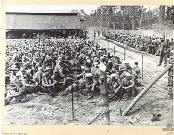
Surrendered Japanese soldiers