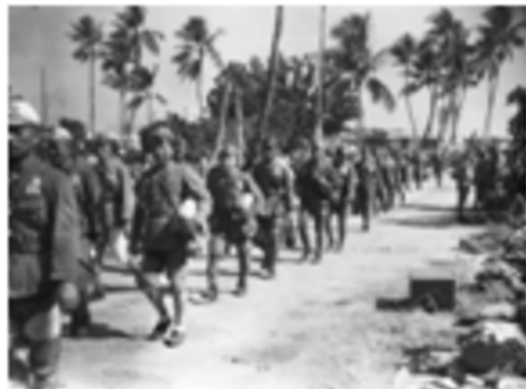
Japanese forces on Nauru

Most employees of the BPC and staff of the Australian administration had left Nauru in February 1942, six months before the Japanese attack. Therefore the Japanese forces found only seven Caucasians - five Australian officials and two European missionaries - and no