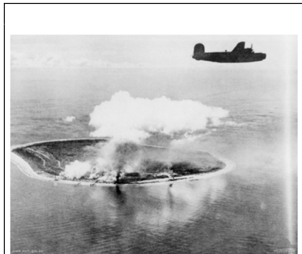
US bombing Nauru

On the night of 25 March 1943, less than three weeks after Takenouchi arrived on Nauru, 15 bombers from the US Army Air Force (USAAF) bombed the airstrip for the first time and destroyed eight bombers and seven fighter planes of the Japanese Navy.