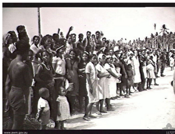
Nauruans attend flag-raising ceremony soon after Australian troops took over the island on 13 September, 1945

until November 1945 before all the Nauruan survivors were sent to Tol Island. They were finally sent back to Nauru by the BPC ship Trienza in January 1946. Father Clivaz survived the three year ordeal and repatriated to Nauru with the Nauruans, but Father Kayser died on Truk because of ill treatment by the Japanese. 35