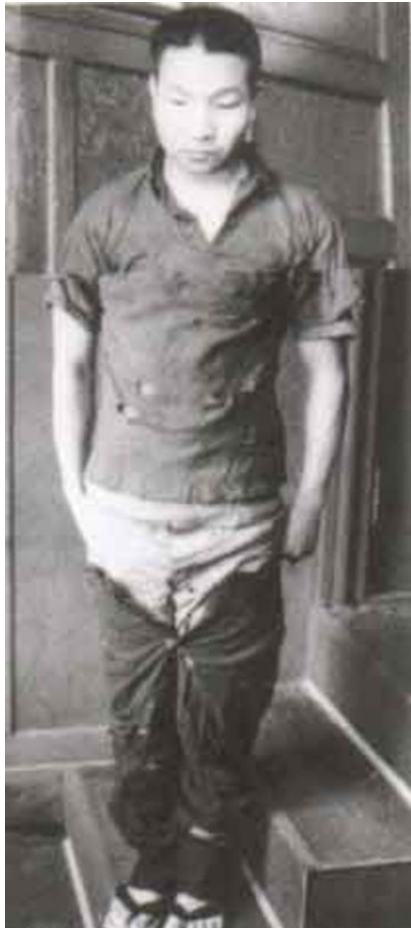
Hakamada Iwao trying on the pants police "discovered" in the miso tank (1976)

The Shizuoka District Court saved its strongest language for the end of its opinion, where it explained why Hakamada should not only be retried but also released from death row