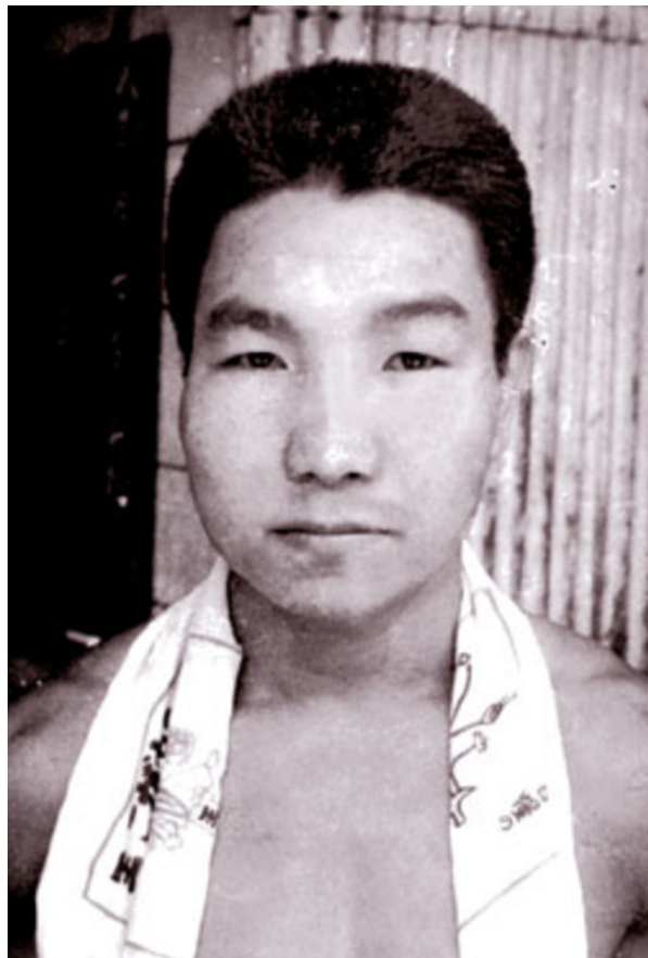
Hakamada Iwao before his arrest in 1966

some lessons that should be learned from this troubling and telling case study. Foremost among them is the need to reduce the level of denial about the possibility of wrongful convictions in Japanese criminal justice.