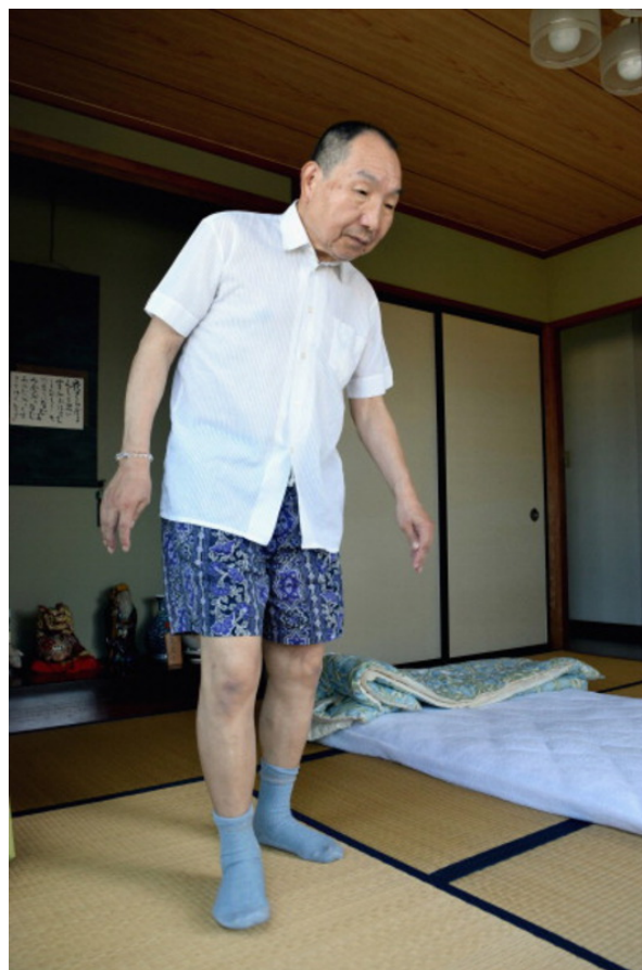
Hakamada Iwao pacing in his sister's house in 2014