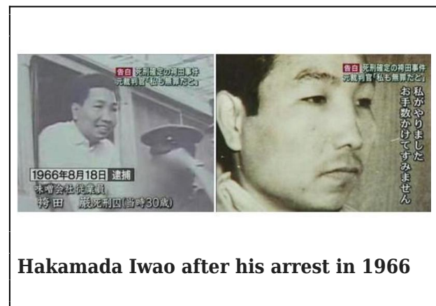
Hakamada Iwao after his arrest in 1966