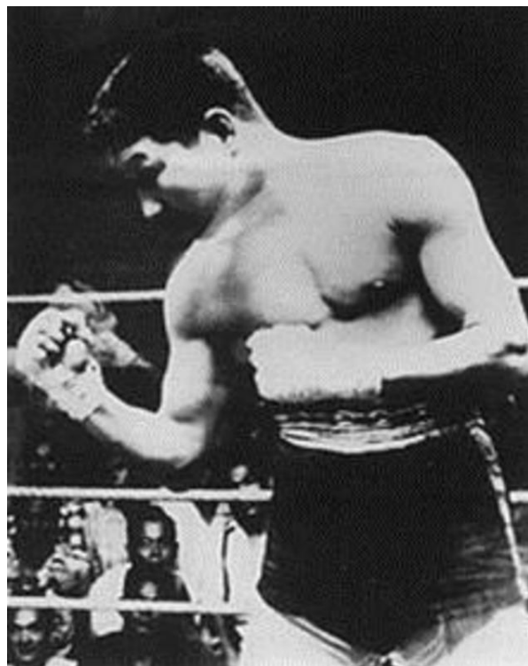
Hakamada Iwao in the boxing ring in the late 1950s