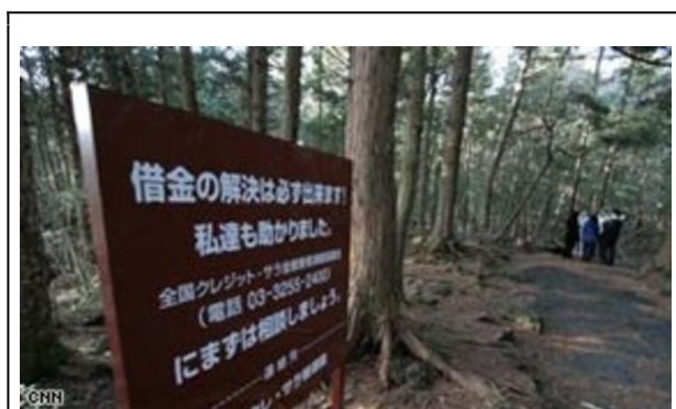
Japan's Aokigahara Forest is known as the "suicide forest" because people often go there to take their own lives

Recently some physiologists raised doubts about curing depression simply by prescribing anti-depressants. There is growing concern among medical professionals that the Administration's plan of simply catching depression in its early stages will work. However, some involved in suicide prevention programs say that doing something is better than doing nothing. Tokyo has so far spent almost all its funds on holding suicide prevention lectures by well-known psychologists and psychiatrists, and sponsoring other events like courses for gate-keepers.