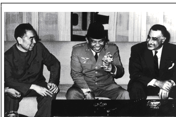
Zhou Enlai, Sukarno and Nasser at Bandung conference

Japan’s anti-white racial solidarity propaganda during the Greater East Asia Co-Prosperity War (1937-1945) was quite influential in damaging the credibility of European empires all over Asia, but especially in Southeast Asia, which Japan temporarily ruled over. Office of Strategic Studies reports emphasized the impact of this propaganda and recommended that the US never advocate a restoration of white Western empires in the region.