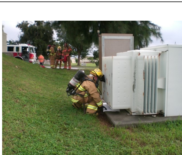
Tests for PCB contamination discovered

As of 1999, the base only checked its drinking water for contamination from "PCBs and other constituents" once a year from a single tap. Water leaving the installation was only monitored four times a year. Today, the installation claims to test its water supply twice a year for PCBs and at specific intervals for other substances, for instance quarterly for arsenic and annually for lead. However the 2014 discovery of high levels of lead in water fountains in an education building and recent failures to warn on-base personnel of elevated PFOS levels have called into question the reliability of such tests. 18