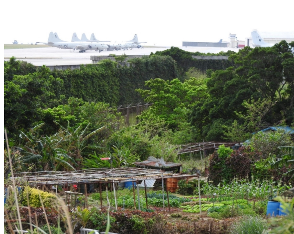
Farmers' fields near Kadena Air Base

Kadena Air Base hosts the biggest combat wing in the USAF - the 18th Wing - and, during the past seven decades, the installation has served as an important launch pad for wars in Korea, Vietnam and Iraq. Given the long history of Kadena Air Base and its city-sized scale, it is easy to understand why the USAF calls it "The Keystone of the Pacific."