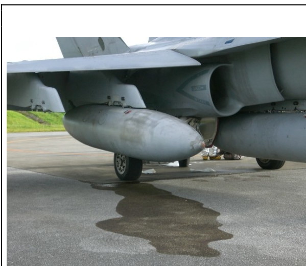
Leaks of jet fuel - such as this small one in 2008 - totaled more than 40,000 liters since 1998

In January, the USAF released 8725 pages of accident reports, environmental investigations and emails related to contamination at Kadena Air Base. Dated from the mid-1990s to August 2015, the documents are believed to be the first time such recent information detailing pollution on an active U.S. base in Japan has been made public.