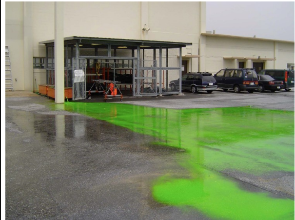
An unknown substance claimed to be sea dye leaks from a tank on Kadena Air Base in an undated photo. No records exist for the spill suggesting it was unreported even within the military.

Another threat to Okinawa's drinking water comes from leaks of raw sewage, which the base apparently only started recording in 2010. In November 2010, a 57,000-litre spill contaminated the Shirahi River and the sea with sewage measuring 36,000 fecal coliform colonies/100ml - 90 times the EPA's maximum limit for swimming waters.