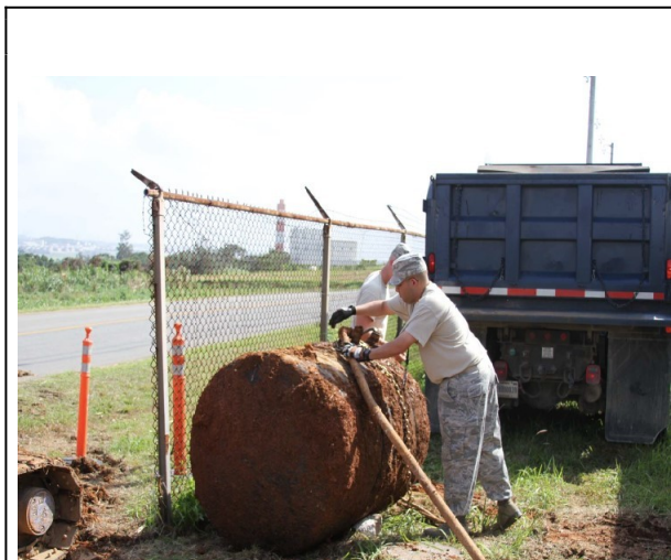
An abandoned storage tank endangered farmers' fields when it leaked 450 liters of fuel in March 2012

know very little of their hazardous history - particularly when it comes to the disposal of toxic substances.