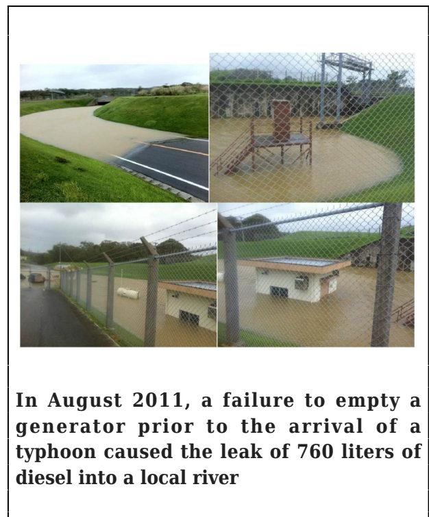
In August 2011, a failure to empty a generator prior to the arrival of a typhoon caused the leak of 760 liters of diesel into a local river

For example, in August 2011, 760 liters of diesel spilled into the Hija River when an operator abandoned a generator tank prior to the arrival of a typhoon. In December 2011, 1,400 liters of diesel leaked from USAF housing on Camp McTureous due to officials ignoring a warning light; the fuel contaminated the Tengan River.