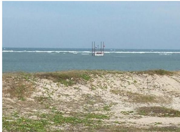
The first nuclear power plant will be built on this site in Ninh Thuan Province in southeastern Vietnam

According to the plan, by 2014, all residents of the village will be relocated two kilometers away and the village will become a nuclear power plant village. He too will have to part with his grape fields, which he must have cared for painstakingly. “They say that they will give us substitute farms in the area we relocate to. No one is delighted to leave the village, but it can’t be helped as it’s for the development of the country.”