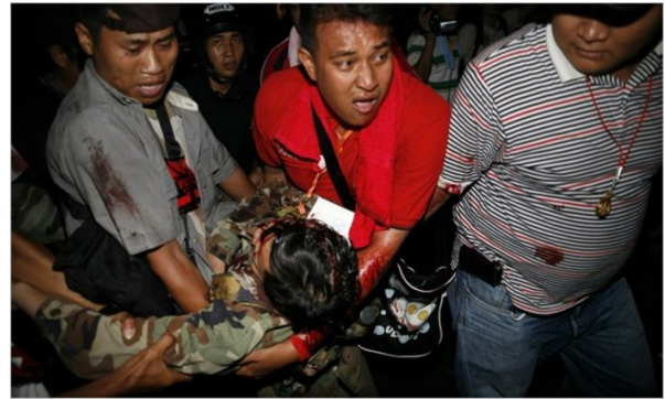
Seh Daeng shot

The sniper shooting of Seh Daeng, Maj. Gen. Khattiya Sawasdipol, on May 13, 2010 by an unknown assailant while chatting with foreign reporters has brought to rupture the standoff between Reds and Yellows in the heart of Bangkok and signals a new stage in the movement and its repression. Seh Daeng, whose nickname means “red commander”, was the reddest of the red shirts. His daughter, who sat at his bedside in the hospital until he succumbed to his grievous wounds on May 17, 2010, has been a staunch supporter of the yellow shirts, illustrative of the convoluted politics of the era. To better put in context the convoluted color-coded politics of the present day, and to identify some of the key heroes and villains and historic reference points being talked about on both sides of the barricades in Bangkok, a brief review of Thai political activism over the years will follow.