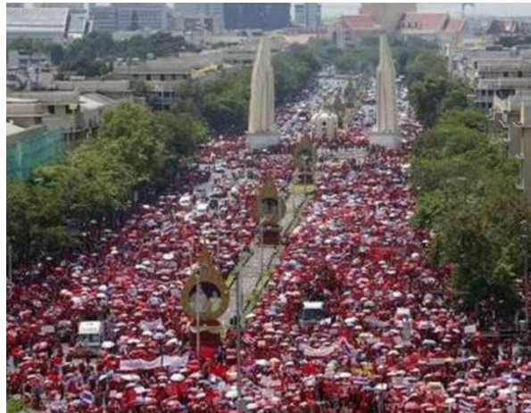
Red shirt protest in Bangkok