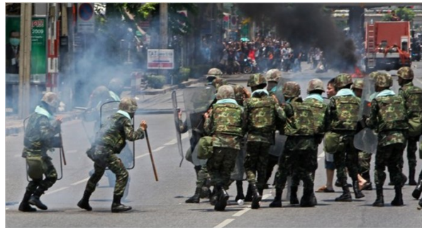
May 14, Thai forces move against protesters

As I write, the military has at last unleashed its terrible power and reports from Bangkok suggest the city is being turned into a bloody war zone.