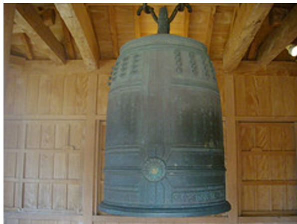
Bridge of Nations Bell (1458)

Peace and security in East Asia depend on the governments and peoples of the region taking the initiative to remove the “wedges of containment” that US planners left ambiguously and threateningly embedded in the state system they designed more than half a century ago.