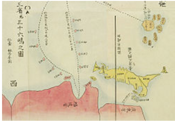
Hayashi Shihei's map from his Sangoku tsuran zusesu

(General outline of three countries), 1785 26