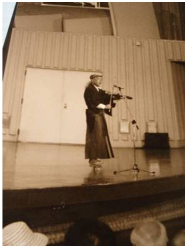
Ueno Park, 1999

“traditions” was relevant, but in a way I had not previously considered.