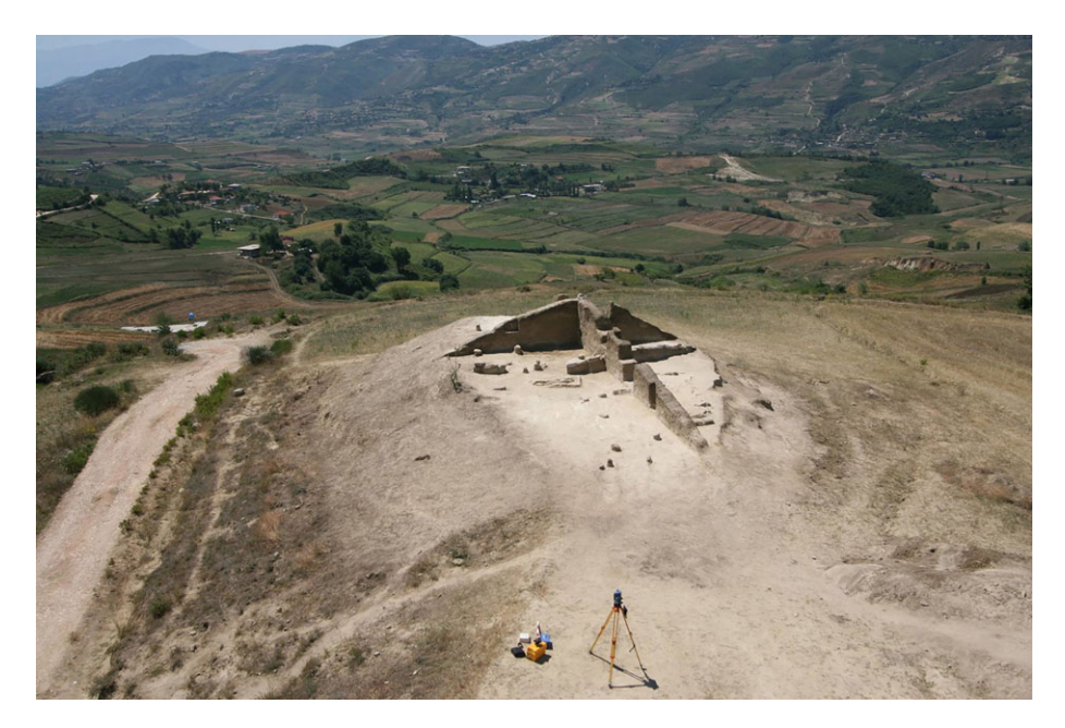
Fig. 7.3. The excavated tumulus at Lofkënd.

mosaic floors and inscriptions. In the later sixth century, the settlement was abandoned (Muçaj et al. 2019).