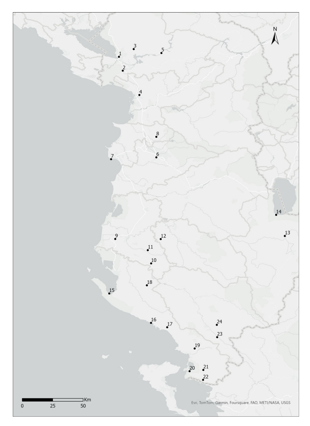
Map 7.1. I. Shkodra; 2. Bushat; 3. Drivastum/Drisht; 4. Lezha; 5. Komani-Sarda; 6. Epidamnos/Dyrrachium; 7. The Artemision of Epidamnos-Dyrrhachium; 8. Zgërdhesh; 9. Apollonia of Illyria; 10. Byllis; 11. Lofkënd; 12. Dimal; 13. Sovjan; 14. Pogradec; 15. Orikos; 16. Himara; 17. Borsh; 18. Amantia; 19. Phoinike; 20. Butrint; 21. Dobra; 22. Çuka e Ajtoit; 23. Hadrianopolis; 24. Antigonea.

GIS analysis indicates that hillforts typically possessed clear lines of sight with each other and therefore may have operated collectively, as members of a settlement/defensive system, to allow communication and to monitor movement in and out of the mountains.