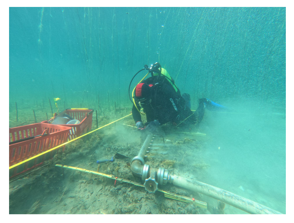
Fig. 7.4. The excavation of the prehistoric lake shore village of Lin 3 on Lake Ochrid.

partially resettled in the fifth/sixth centuries AD. Archaeological excavations undertaken in different sectors intra muros , brought to light important public monuments (Heinzelmann and Muka 2014), while extra-urban investigations revealed the presence of two different funerary areas (Muka and Heinzelmann 2014; 2016; Heinzelmann and Muka 2015; Muka, Heinzelmann and Schröeder 2020).