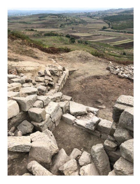
Fig. 7.2. Apollonia excavations of the northeast gate.