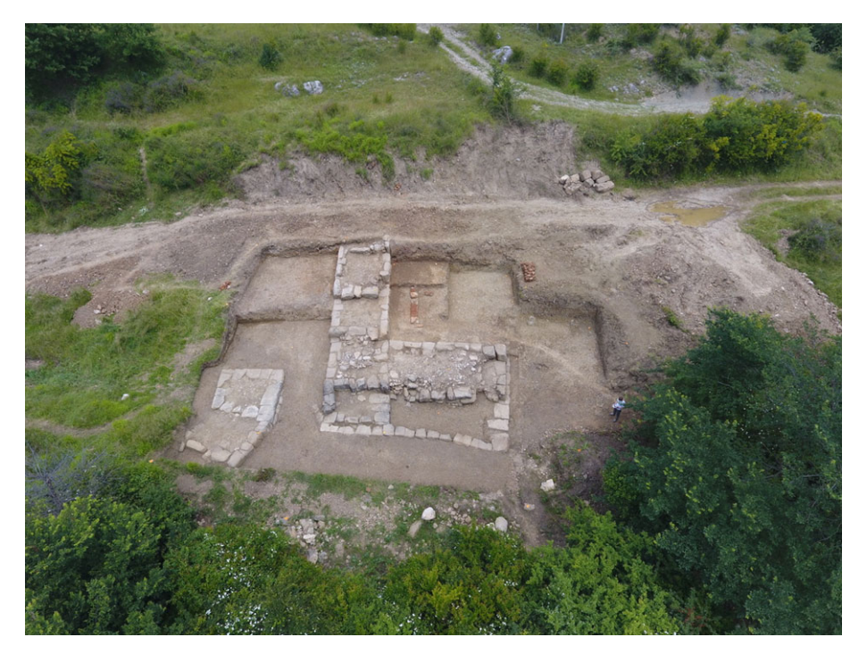
Fig. 7.1. Bushat, aerial photo of the city gate protected by a tower.

The mortuary landscape similarly worked to integrate hillfort communities rather than separate them.