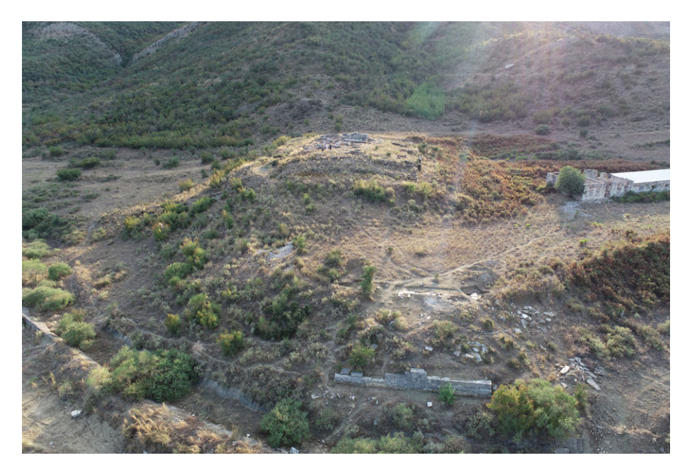
Fig. 7.6. The Hellenistic lower site and the upper and residential complex at Dobra.