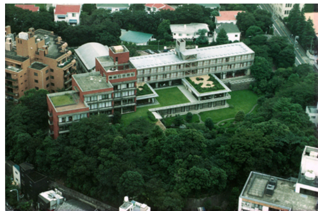
Rockefeller-funded International House in its latest expansion

focused their utmost attention on Japanese historians, who, they recognized, had a great influence on Japanese readers. This effort was conducted against the backdrop of Japan's role as a battleground of the cultural cold war in East Asia and the U.S. government's deep commitment to fighting communism throughout the world. Actually, the Rockefeller Foundation also played a large part in fighting communism--it contributed significant funds to the humanities, of which history was an important part. For example, from 1950 to 1960 the total grants in the humanities given by the Rockefeller Foundation reportedly amounted to $37.6 million, of which about $7 million (roughly 19 percent) was earmarked for work in history.[45] Apparently, Japanese historians attracted the attention of American philanthropic foundations, including the Rockefeller Foundation.