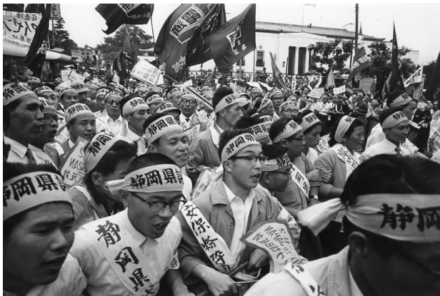
Protestors from Shizuoka Prefecture join demonstrations in Tokyo on June 11.