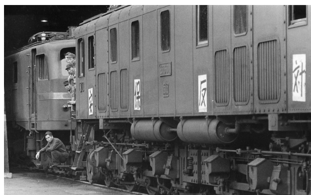
June 22, 1960. Striking rail workers sit on an idle train in a yard in Tokyo. The signs attached to the side of the car read "Against Anpo," one of the most common slogans of

the protest. The general strike on June 22 was the third strike that month. It involved 6.2 million workers and shut down the trunk line running from Tokyo to Osaka for the first time in history.