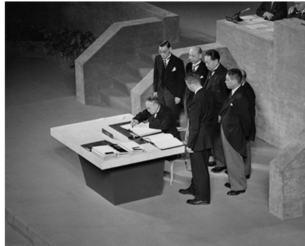
Japanese Prime Minister Yoshida Shigeru signs the San Francisco Peace Treaty on September 8, 1951. 47 other countries also signed the treaty.

It was against this background that the Allied occupation formally and finally came to an end. The Treaty of Peace with Japan, popularly known as the San Francisco Peace Treaty, was signed by Japan and 47 other nations in September 1951, laying out the terms, widely regarded as generous, for Japan to resume sovereignty in 1952. Only a few hours later on the same day, however, Japan signed a second, bilateral security treaty with the United States. This established the terms of a continued military alliance between the two countries, and locked Japan firmly within the orbit of U.S. cold-war strategy.