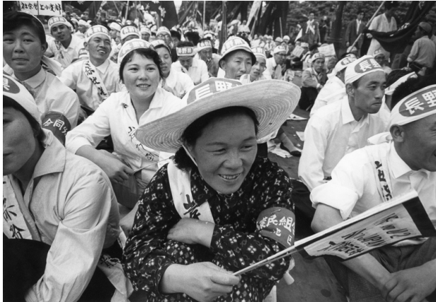
A farmer, part of a group from Nagano Prefecture, participates in a protest in front of the American embassy on June 11, 1960.

dozens of women's organizations, were major constituents of the Anpo protests.