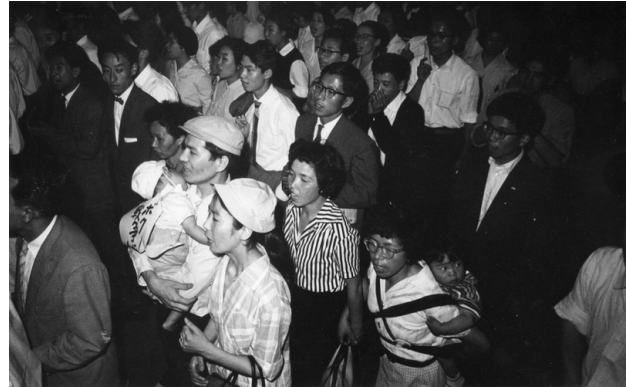
Families with children participate in a rally on June 18. One child has a message attached to him that speaks in the child's voice. Though part of the sign is obscured it probably reads something like "I hate war" ( Boku wa sensō ga iya da ). Many parents were politicized around the security treaty issue through their role as protectors of their children. For the people demonstrating here, the Anpo treaty was taken to be a threat to the safety of their families.

Students are a final group who played a pivotal role in the 1960 Anpo demonstrations. Zengakuren ( Zen Nihon Gakusei Jichikai Sōrengō , or All Japan League of Self-Governing Student Associations) was the most important network of student activists. After forming in 1948 out of a movement to resist U.S. "imperialism" in reforming the university system, it would remain a formidable bastion of anti-American sentiment and left-wing politics throughout the postwar.