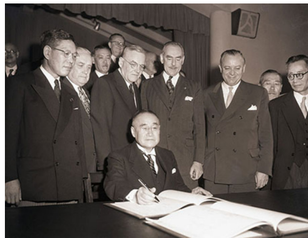
A smaller gathering later the same day, when the separate, bilateral U.S.-Japan security treaty was signed.

The terms of the two treaties reflected ongoing U.S. anxieties about the spread of communism in East Asia. The Treaty of Peace excluded key countries, including some of Japan's most significant neighbors and former enemies. The Soviet Union, Korea, India, and—perhaps most importantly—China were not signatories. Both the Soviet Union and India refused to sign