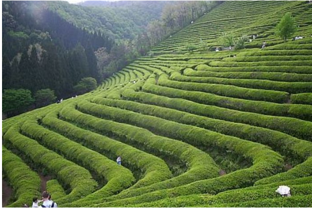
Green tea field, Korea

As a third and final example of diffusion, one that happened in totally unexpected ways, I refer to the spread of the soybean and its byproducts. Soybeans, as I noted, were known in the West at an early time. But not until World War I did that interest become commercially relevant, as wartime demand for oil, particularly for industrial uses, shot up. In the U.S., soybean production rose, but principally for its oil, while the plants were ploughed under to enrich the soil. Between world wars, American soybean production remained minor. But with World War II, soybeans became economically important once more. Once again, though, soybeans were not important as a primary food. This is the most dramatic aspect of the diffusion of soybean cultivation and use to the West: a transformation of the uses to which soybeans were put. The stress upon exportation, the manufacture of cooking oil, and the provision of animal feed became the fate of what had been Asia's greatest contribution to global vegetable protein consumption. When we note that the annual soybean crop in the U.S., the world's leading producer of soybeans, provides enough protein for the needs of the U.S. population for three years, it is startling to realize that hardly any humans get direct benefit of that protein. In the U.S., much of the protein is fed in meal to chickens, which are then fried in soybean oil in fast-food restaurants. It is the birds – or pigs,