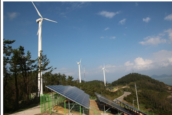
Wind turbines and solar panels used in Microgrid on Gasa Island: Courtesy of KEPCO.

provide microgrid solutions was based on the company's experiences in the Jeju Island Smart Grid testbed. 51