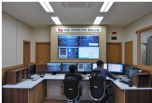
Gasa Island Microgrid Control Centre: Courtesy of KEPCO.

Of course, as with all new technological advances, challenges remain. The most significant is that in the short-term, the initial outlay of costs in installing a microgrid system is substantially higher than investing in diesel power plants. However, in Chae Wookyu's view (the chief engineer in the Gasa Island project), the initial cost of approximately 4.2 billion Won for a microgrid system could be recouped within 16 years of operation. 55 He expects these savings would arise from lower fuel and management costs while providing electricity at the cheaper rates mentioned above. Doing away with the exorbitant costs of transporting barrels of diesel alone, could arguably achieve significant cost savings. Separate reports by foreign competitors such as Caterpillar in 2016 estimate a payback period of only 5 to 6 years. 56 Independent commentary by Navigant Research estimates an even more ambitious figure of four years or less to gain a Return On Investment (ROI) (assuming cost of diesel at $1/L), up to three years at $1.36/L and up to two years at $1.64/L. 57