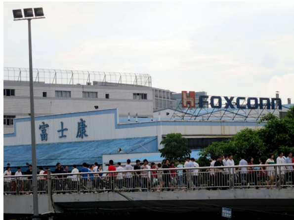
Foxconn workers flood in and out of the Longhua factory in Shenzhen, Guangdong. Hon Hai Precision Industry Company, known by its trade name Foxconn, is headquartered in Taipei.