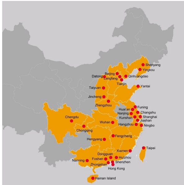
Map 1. Foxconn's Locations in Greater China

Sources: Foxconn Technology Group company websites.