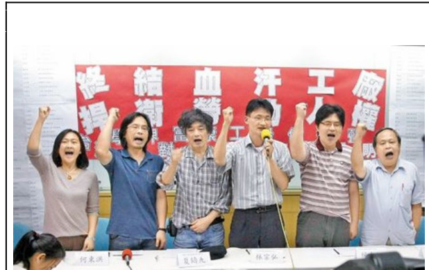
Taiwanese researchers' press conference on 13 June 2010 called on Foxconn: "End to sweatshop" and "Defend labor and human rights."

On the basis of these two open statements linking scholars and students from mainland China, Hong Kong and Taiwan, a large-scale collective investigation of Foxconn was set up in the summer of 2010.