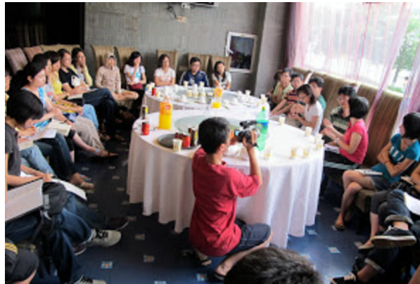
40 students and scholars from Hong Kong, China, and Taiwan take part in research skills training preparatory to conducting fieldwork in Foxconn factories, worker dormitories, and public spaces.

at different hostels and carrying out interviews and surveys in the Longhua and Guanlan industrial communities, where the two mega factories of Foxconn are based.