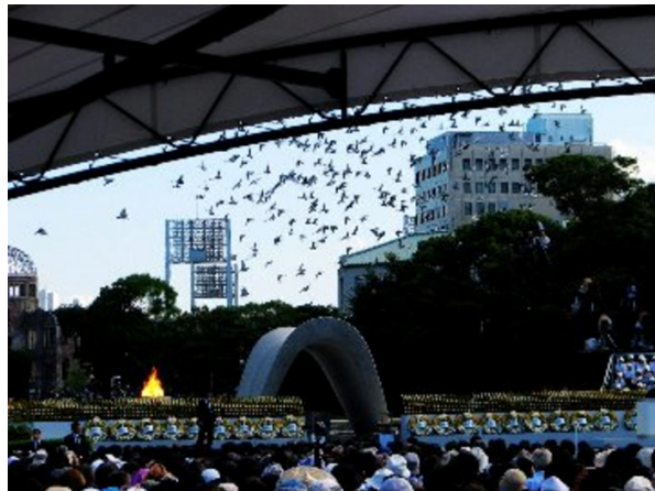
Doves released at Hiroshima Memorial Ceremony

press conference on August 5, “With respect to Hiroshima and the anniversary of the atomic bomb, this President, President Obama, is very committed to working toward a world without nuclear weapons...And I think that the Obama Administration and President Obama himself believed that it would be appropriate for us to recognize this anniversary and so has proceeded to do so.” 42 It was rare, and probably unprecedented, for a US Secretary of State to specifically comment on Hiroshima on the anniversary day. 43 The world media paid special attention to the fact that the US attended for the first time – with CNN, BBC, Aljazeera, Korea’s Yonhap News, China Central Television, and Russia’s ITAR-TASS, all reporting this. 44