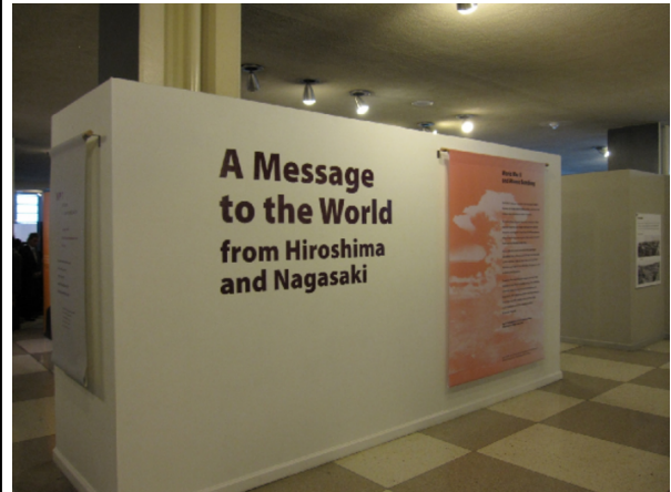
A-bomb Exhibit at UN Visitor Centre

This May, the hundred hibakusha were active in New York. For the first time, Hidankyo hosted a large A-bomb panel exhibit in the U.N. Headquarters' Visitor Centre's lobby, which ran from May 3 to the end of June. Hibakusha took turns attending the exhibit, answering questions and telling their stories to visitors. Hidankyo representatives met with Secretary General Ban Ki-moon, and wrote to all 192 member states of the U.N. requesting to visit their U.N. mission's offices. They were able to visit seven of them - Brazil, Malaysia, Japan, New Zealand, Sweden, and surprisingly, two nuclear weapon states, Russia and France. In fact, France did not respond, but French anti-nuclear activists who were in town for the conference brought Hidankyo delegates to their representative's office, and a meeting took place.