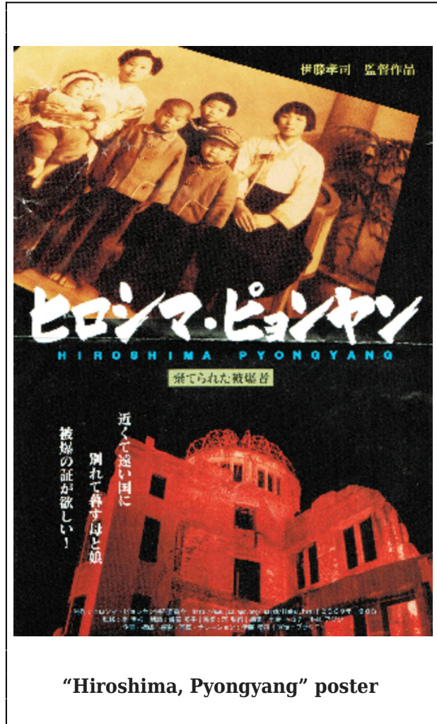
“Hiroshima, Pyongyang” poster