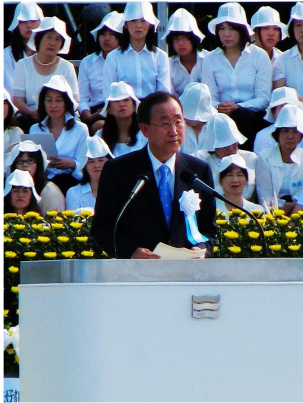
UN Secretary General Ban Ki-moon at Hiroshima Memorial, August 6, 2010

There was something, however, that I was expecting to hear in Ban's speech and did not--the idea of a Nuclear Weapons Convention (Convention on the Prohibition of the Development, Testing, Production, Stockpiling, Transfer, Use and Threat of Use of Nuclear Weapons and on their Elimination). Such a goal is supported by Ban, as well as by atomic-bomb survivors' organizations like Nihon Hidankyo , Mayors for Peace, and many other NGOs around the world. It was also mentioned, if rather subtly, in his "five-point plan to rid the world of nuclear weapons." 28 Ban said, "I especially welcome your support for the idea of concluding a Nuclear Weapons Convention," at the NGO Conference at Riverside Church, on May 1. 29 The idea of such a convention was included in the final document of the 2010 NPT Review Conference because of Ban's strong