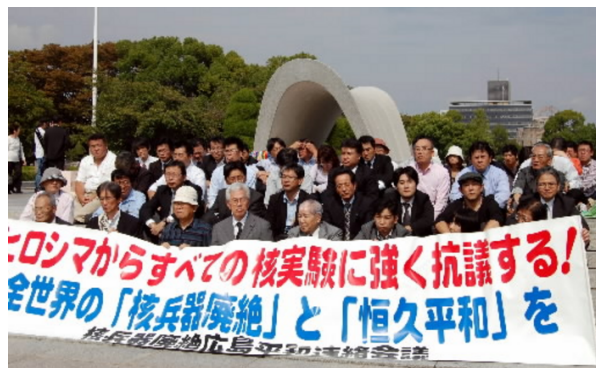
Hiroshima's protest against the first nuclear test under Obama administration