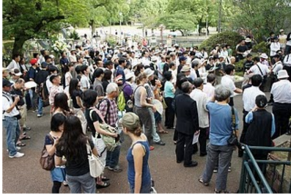
Memorial gathering for Korean victims of Nagasaki atomic bombing, August 9, 2010

could be related to the 100th anniversary of annexation, and Ban's visit to Nagasaki.