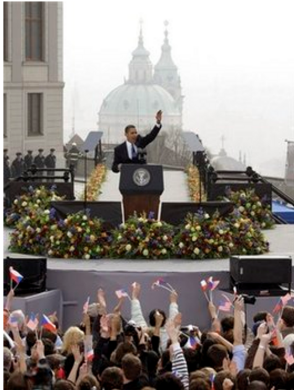
Obama speaking in Prague, April 5, 2009

This May, the hundred hibakusha were active in New York. For the first time, Hidankyo hosted a large A-bomb panel exhibit in the U.N. Headquarters' Visitor Centre's lobby, which ran from May 3 to the end of June. Hibakusha took turns attending the exhibit, answering questions and telling their stories to visitors. Hidankyo representatives met with Secretary General Ban Ki-moon, and wrote to all 192 member states of the U.N. requesting to visit their U.N. mission's offices. They were able to visit seven of them - Brazil, Malaysia, Japan, New Zealand, Sweden, and surprisingly, two nuclear weapon states, Russia and France. In fact, France did not respond, but French anti-nuclear activists who were in town for the conference brought Hidankyo delegates to their representative's office, and a meeting took place.