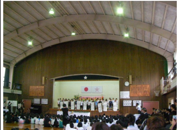
Shiroyama Elementary School Peace Ceremony, Nagasaki, August 9

Novelist and Nobel laureate Oe Kenzaburo, in his column for the New York Times for the Hiroshima Day 2010, wrote of the Hiroshima ceremony as follows: “Of all the official events that have been created during the past 200 years of modernization, the peace ceremony has the greatest degree of moral seriousness.” 61 There are doubtless other peace ceremonies throughout the world that carry equal “moral seriousness,” but those in Hiroshima and Nagasaki, which I have attended for the last five years, have embraced me and my whole being in ways unlike any others. I appreciate children’s participation particularly. For me, the climax of the annual study tour is always attending the memorial ceremony at Shiroyama Elementary School in Nagasaki. Over 1,400 of the students and 31 teachers of this school, which is located 500 meters from the hypocentre, died in the atomic bombing. The school has its own peace ceremony and all students attend, though August 9 falls in the summer holiday. Peace meetings are in fact held at Shiroyama Elementary, not just in August; but on the 9th day of every month, and they have been conducted for almost 60 years since 1951.