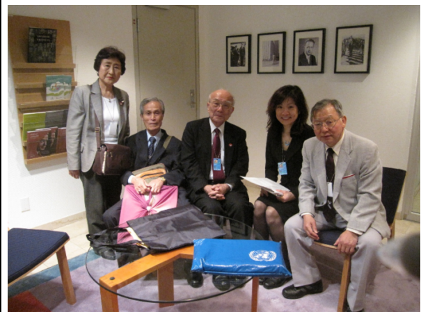
Hidankyo Executives at UN Swedish Mission 12

The hibakusha visited forty schools, telling their stories to local students. Another group of over one hundred people served as local volunteers, most of them bilingual Japanese-Americans, who contributed as translators and helpers for hibakusha during school visits, demonstrations, and conferences. The hibakusha, local volunteers, and international activists shared a real sense of camaraderie. The highlight of hibakusha activism in New York was the rally and demonstration held at Times Square on May 2 by volunteers and sponsors of peace and anti-nuclear