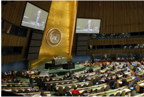
NPT Review Conference in the General Assembly Hall

There was general dissatisfaction among non-nuclear states that, during the course of the negotiation, nuclear states refused to set a clear timetable for total elimination of nuclear weapons or to hold a conference for disarmament in 2014 to set a schedule for abolition. The idea of convening an international conference to formulate a roadmap for nuclear abolition, which was in the earlier draft, was eventually removed. 25 Nor was the deadline of 2025 sought by 118 nations of NAM (Nonaligned Movement states) for complete nuclear disarmament included in the final document. The plan for a 2012 Middle East nuclear free-zone conference appeared to be the most concrete agreement in the final document, but the US and Israel dissented immediately. Barack Obama “strongly opposed” Israel, the only nuclear power in the Middle East, being singled out. 26 (For a summary of media reports and assessments of NPT 2010, see Link .)