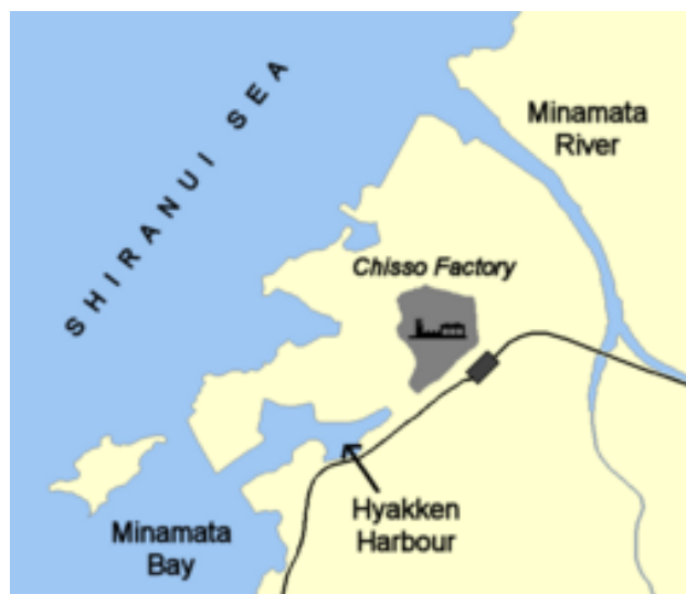
Chisso plant, the Shiranui Sea, and the plant runoff

I often used to go together with my blind, half-mad grandmother to visit this Umawari no Tomo, which in later years would take on such profound significance. There were also times that I went by myself. It was at the beginning of the Shōwa era, before I began primary school. No one lived on the embankment, and when adults gathered to drink they spoke about Umawari no Tomo as “the place where they come out to play”—they meaning various divine beings, foxes and kappa , “Motan no Moze” or “Tabira no Taze” or “Gane no Aragami-sama,” among other invisible deities. When night fell, from Nagasaki and Shimabara, from the Satsuma islands, they would come over, one after another, crossing the Shiranui Sea.