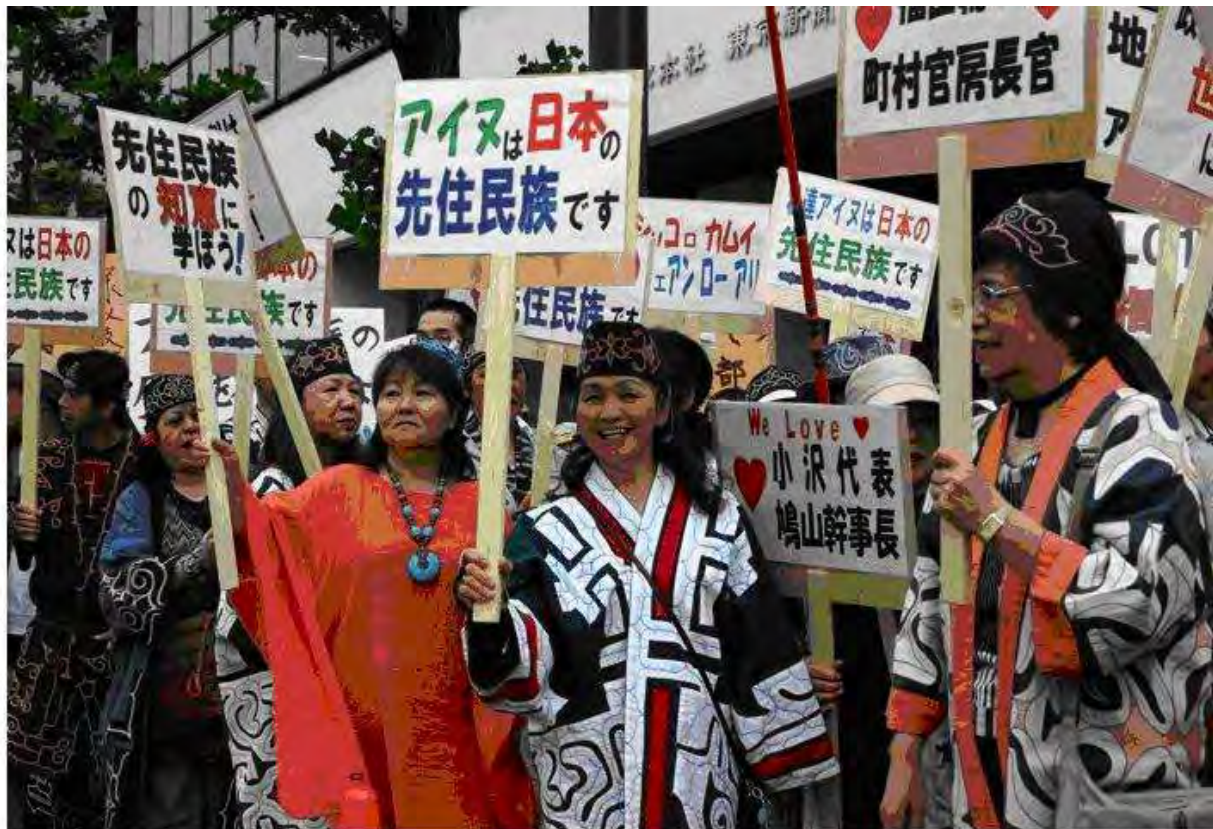
Ainu Women: A vocal majority for indigenous recognition

from across Japan. Adorned in traditional kimonos and waving placards anticipating the G8 environmental theme, “Ainu are kind to the earth” and “the Earth is on loan from our children,” the group marched toward the Diet buildings. Here Ainu Association directors formally read and delivered a formal request for indigenous rights to assembled lawmakers.