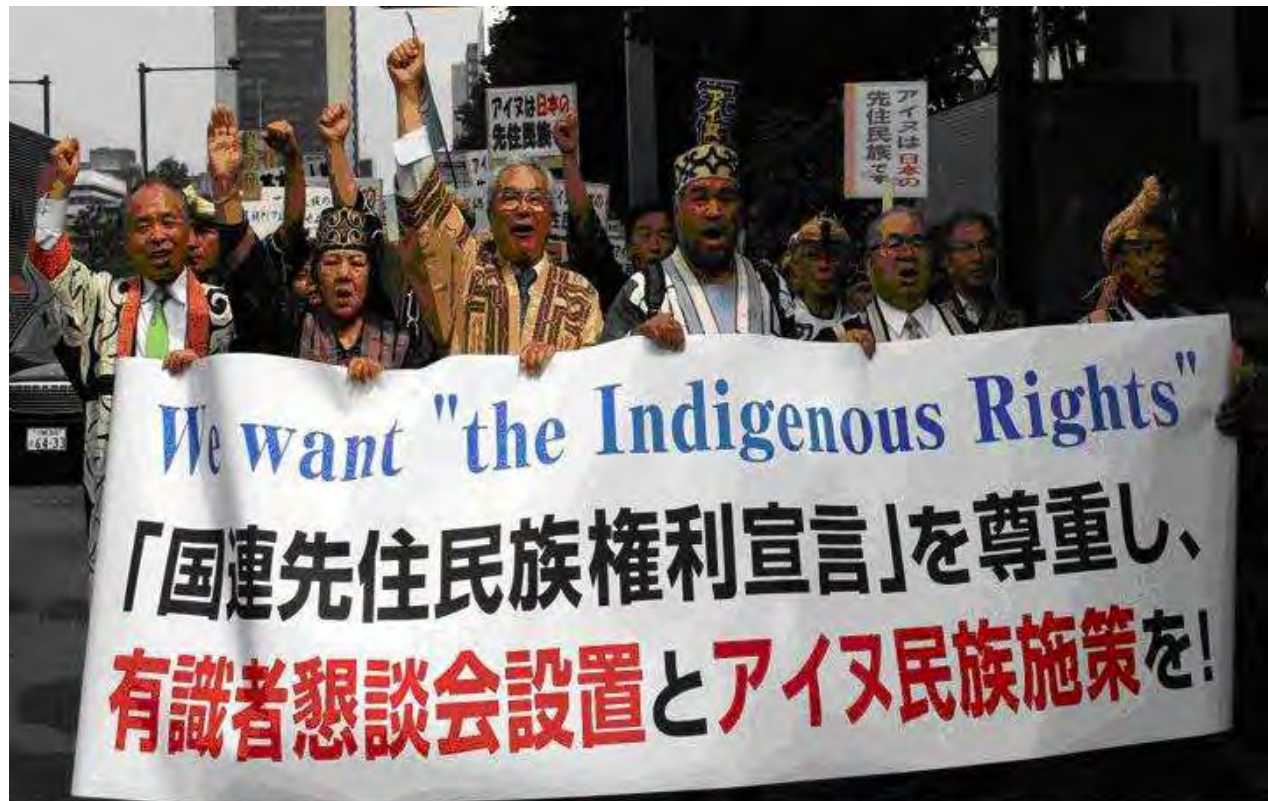
Tokyo: Mass Ainu March for Indigenous Rights, May 22, 2008

Ainu people, 3) that a nationwide survey of Ainu living conditions be enacted as a precursor to implementing a national policy; 4) that the Ainu Cultural Promotion Act (1997) be reviewed; 5) that a new Ainu/ethnic law be implemented; and 6) that a commission of inquiry be set up to design this Ainu/ethnic law. If the mounting domestic pressure were insufficient, international society added its own support in mid-May. During the Universal Periodic Review of Japan, member states in the UN Human Rights Council's Working Group recommended the Japanese government initiate dialogue with Ainu and undertake a review of land and other legal rights of Ainu people as steps toward implementing DRIP in Japan . [23]