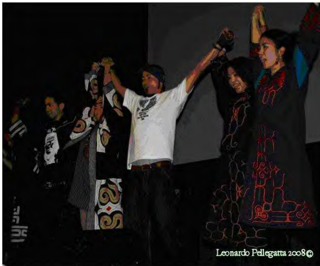
Resistance music: AINU Rebels blend hip-hop and electronica to create a new AINU vibe