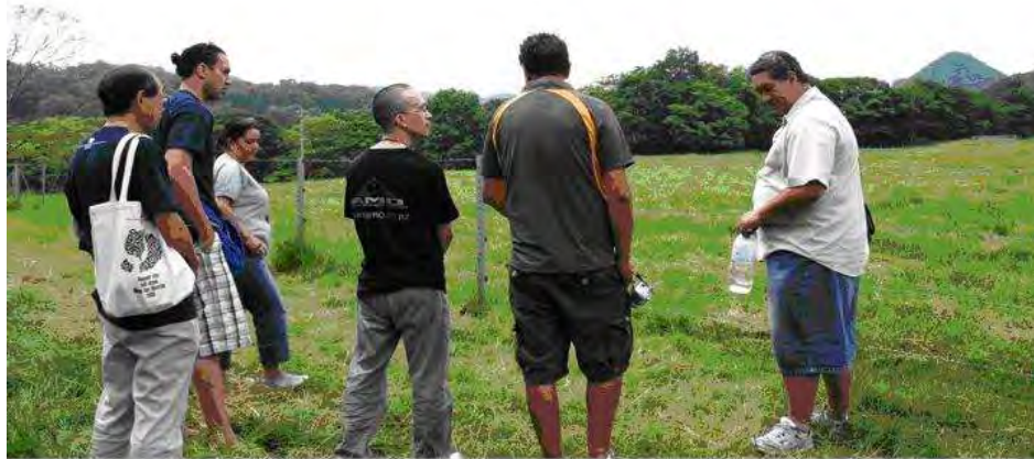
Maori delegation offers a prayer in respect for cinomisir and Ainu ancestors