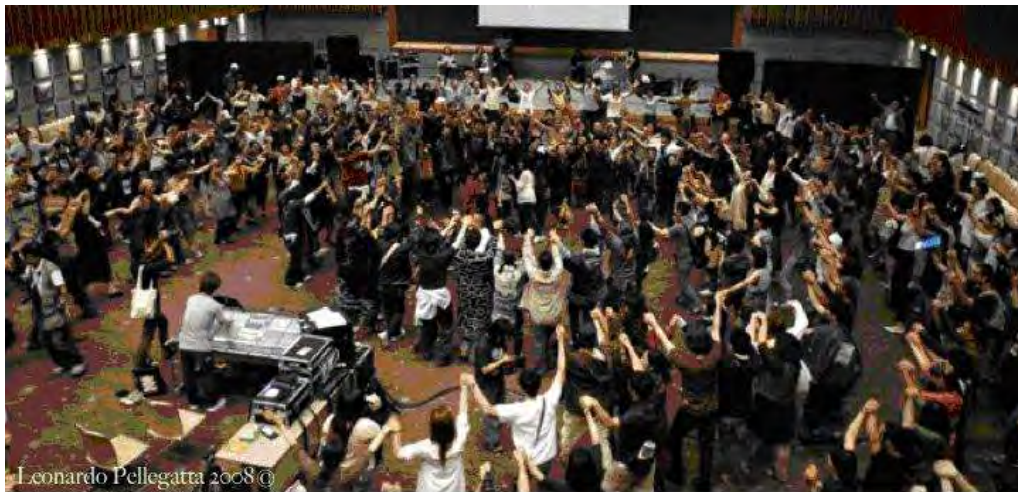
Drawing everyone into the circle: Giant Poro Rimse dance at IPS Finale

with but did not necessarily politically align with Ainu ethnic nationalism in the 1960s and 1970s. Even for Ainu cultural revivalists, however, cultural practice is continued in a separate domain from livelihood, which is predominantly aligned with the majority Japanese economy of consumption. A glimpse of the global diversity indigenous peoples represent was in evidence at the IP Summit. Indigenous perspectives spanned the gamut between industrialized and developing nations, land-rich and land-poor, environmentally-engaged and rights-focused, urban and rural, the global South and the global North, and language-intact and language-moribund communities.