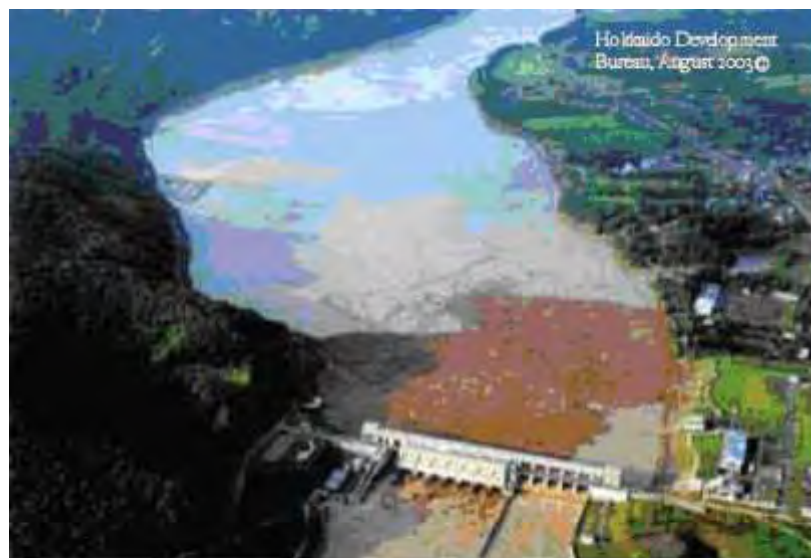
Aerial view of Nibutani Dam, nearly submerged by silt and driftwood during the 2003 typhoon

Taking place just ahead of the Toyako G8 Summit with its climate change centered theme, the IPS sought to highlight environmentally-sound practices embedded in indigenous lifestyles, and to critique the growth-based economic model advocated by industrialized nations. Indigenous communities argue that they have a special mandate to address the global environmental crisis because they are directly dependent on the natural environment for their livelihood, experience immediate consequences when the environment fluctuates, and have observed and experienced global warming-related changes for decades.[49] Mitigation measures now being introduced to combat global warming have also adversely affected indigenous communities in what might be dubbed “neo-energy colonialism.” During the last century, indigenous peoples’ lands were targeted for fossil fuel extraction; now indigenous-managed lands are being targeted for corn, soybean, and oil palm plantations for bioethanol production. [50] Indigenous peoples are experiencing loss of traditional gathering and agricultural lands due to competition with biofuel plantations and hydroelectric dams. [51]