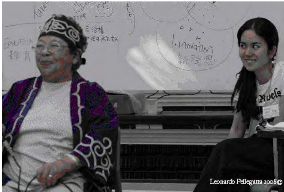
Ukocaranke on Education: Workshops lead to intergenerational discussion