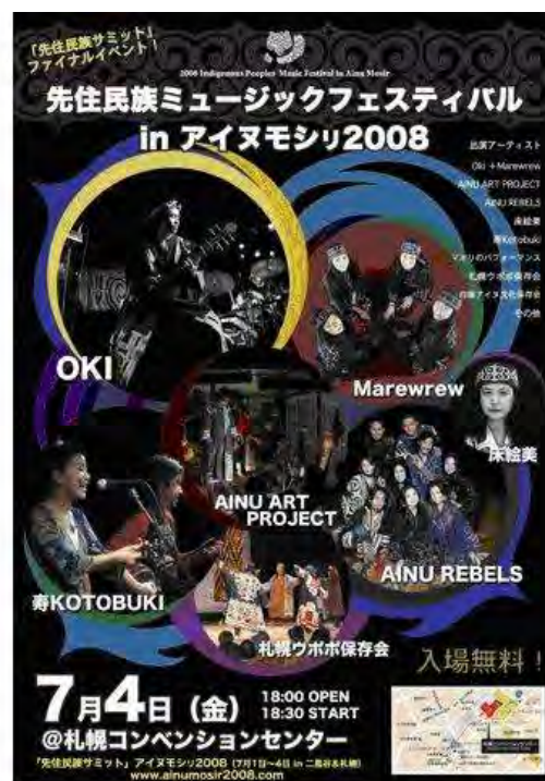
Indigenous Music Festival in Ainu Mosir 2008 poster (Design: W. L. Ding-Everson)