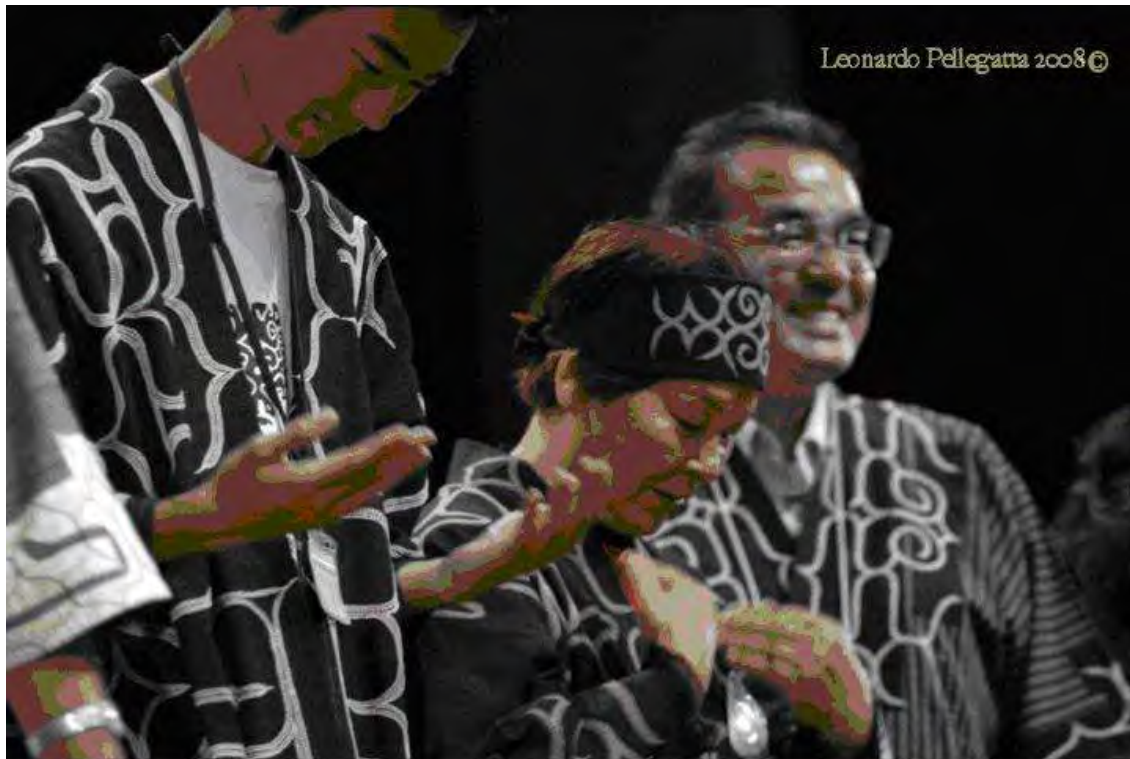
Gestures of thanks from the Executive Council at IPS Start

During the IPS itself, with Ainu participants gathered from across Hokkaido and Japan , there was a sense that the Ainu community had begun a process toward a nation-wide dialogue, including communities and stakeholders dispersed across Japan . As one delegate described it, the IPS encapsulated a “watershed moment,” a moment toward “creating a national Ainu organization that includes all Ainu...all Ainu communities in Japan, men and women, old and young, rural and urban.”[15]