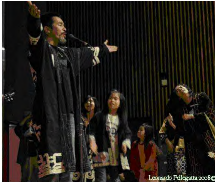
Ainu rock in the family: Ainu Art Project performs traditional songs with hard rock beat