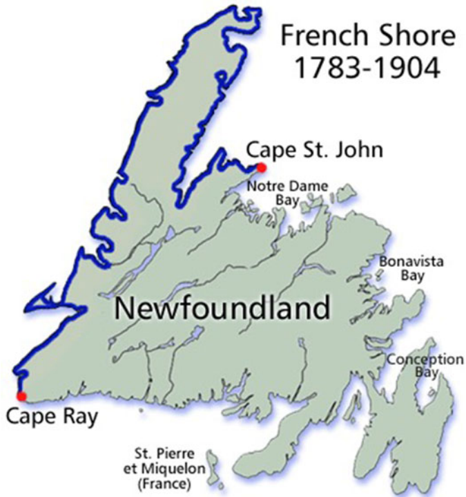
Figure 5. The boundaries of French Shore shifted with the Treaty of Versailles (1783) and remained in place until 1904. Map by Tanya Saunders, Newfoundland and Labrador Heritage Website.

the British to commit in writing to ensuring that French subjects would be able to exercise their fishing rights “without interruption”—or, to use another word, exclusively—in the ministerial declaration that accompanied the treaty. 75 A thrilled Vergennes remarked, “Their concessions with respect to the [...] fisheries [...] exceeded anything I would have believed possible.” 76 The new French Shore would stretch from Cape St. Jean to Cape Raye—that is, from the eastern foot of the Petit Nord down through the entire western coast, forgoing the Central Coast altogether (Figure 5). Yet it is unclear whether British officials agreed to this concession out of a commitment to maintain the island’s status as an interimperial space or because Newfoundland’s position amongst their priorities was shifting. In the decades that followed, the commercial power of the English West Country declined as the money behind the British fisheries came to be based in Newfoundland itself and the island started to look more like