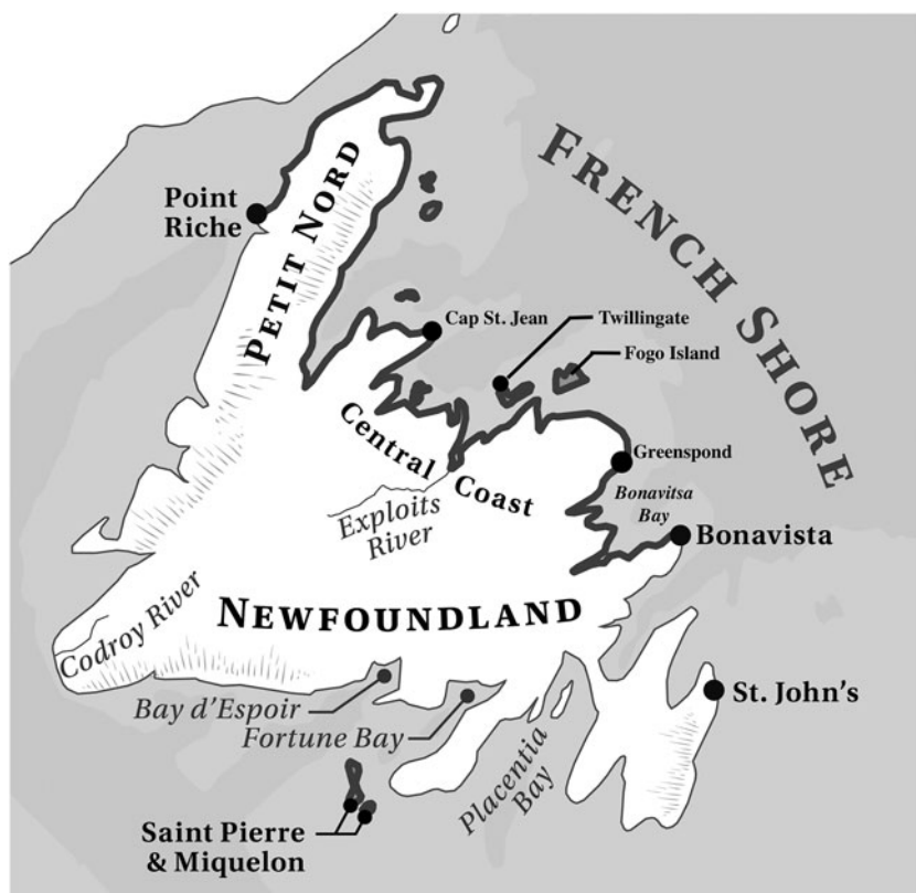
Figure 4. Map of the Central Coast featuring Twillingate, Greenspond, and Bonavista harbors. Map by Meredith Sadler.

Bonavista (Figure 4). Following the loss of Isle Royale in the Treaty of Paris, French fishermen began venturing to the Central Coast for the first time after the Seven Years War. In 1765 Capitaine Girard de la Barcerie went to reconnoiter Twillingate harbor at the behest of the prominent Granville cod merchant Louis Bretel, who advised the French government on matters relating to the fisheries. Barcerie reported that the Central Coast could accommodate more than one thousand fishing boats, which was far more than the three hundred boats the marine had previously estimated. But Barcerie was disconcerted to find that a great many British fishermen had formed permanent habitations on this eastern portion of the French Shore. 45 Foreign minister le duc de Praslin recognized that the settlements posed an even greater challenge to French fishing rights on the French Shore than the seasonal presence of