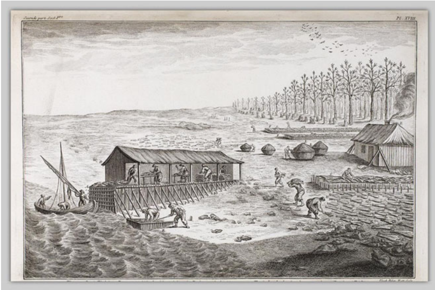
Figure 2. A fishing room at work. Henri-Louis Duhamel du Monceau, Traité générale des pesches (Paris, 1768).

enough to accommodate the crew and their fishing boats, had easily available timber, and were close to inshore fishing grounds. 24 Fishing rooms undergirded the Newfoundland commons. In the French and British fisheries alike, fishing rooms were allotted according to what was referred to as the “first arrivals custom.” The captain of the first ship to arrive in a harbor from Europe could claim whichever fishing room he liked and became the fishing admiral for the year. Each harbor had its own fishing admiral. He was responsible for overseeing the subsequent selection of fishing rooms within the harbor and resolving any disputes that arose during the season. The fishing admiral changed every year according to arrival order, as did the occupiers of each fishing room, though generally speaking captains tended to favor similar areas each year. 25