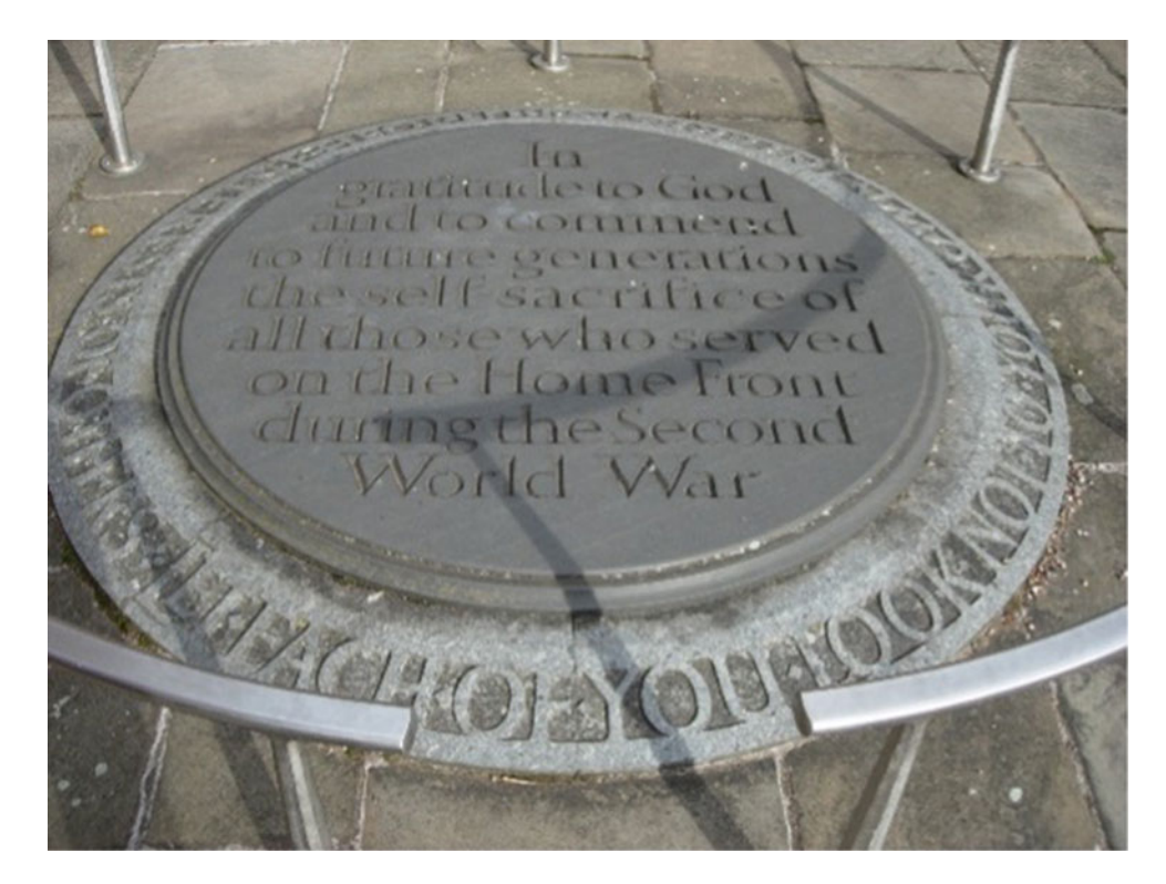
Figure 1. Home Front Memorial, Coventry Cathedral, 2000.

over- and underdetermined," as the poet and critic Susan Stewart puts it aptly. "They stand poised between the forms they were and the formlessness to which, in the absence of restoration, they are destined."