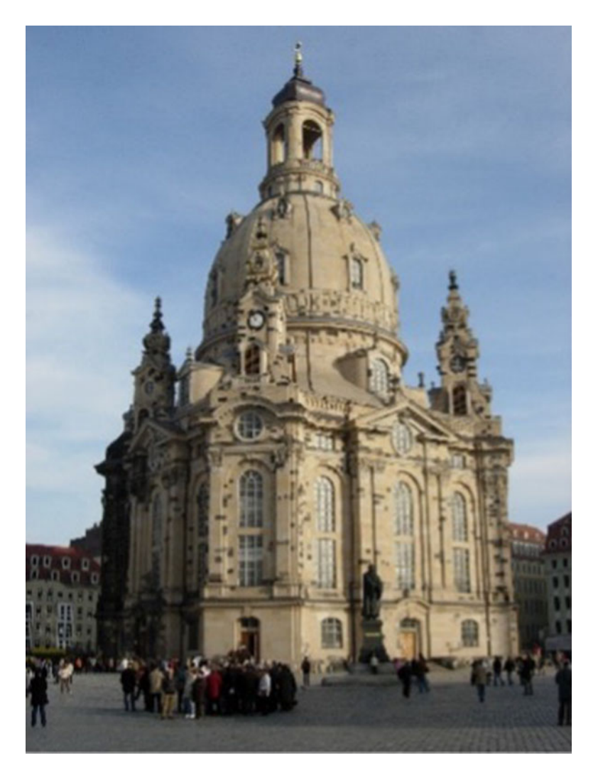
Figure 4. Frauenkirche, Dresden, 1743/2005.

based in Dresden, almost unanimously rejected the scheme, condemning it as gigantic kitsch. The director-general of the State Art Collections, Martin Roth, also heaped scorn on the project. "It's like IKEA," Roth said, by which he presumably meant that it was inauthentic, because, at a cost of \ \in \ 180 million, it was certainly not cheap. <sup>97</sup>