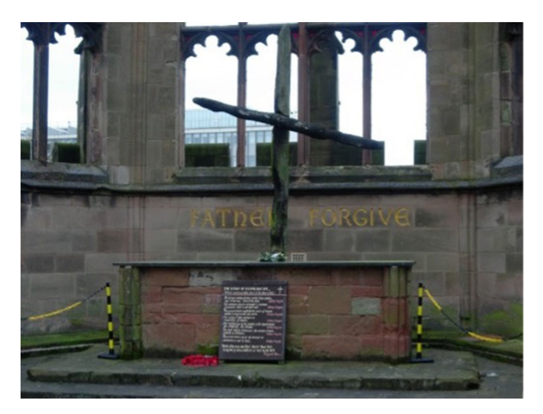
Figure 2. Charred Cross and altar of rubble, Coventry Cathedral, 1940.

symbols: the altar of rubble, the Charred Cross, and the Cross of Nails (Figure 2). All three were fashioned from remnants from the old church and positioned in the ruined apse. The words "FATHER FORGIVE" (Luke 23:34) are carved into the stonework, but significantly omitting "THEM," for the cathedral clergy believed that all were sinners, and all needed to be saved.