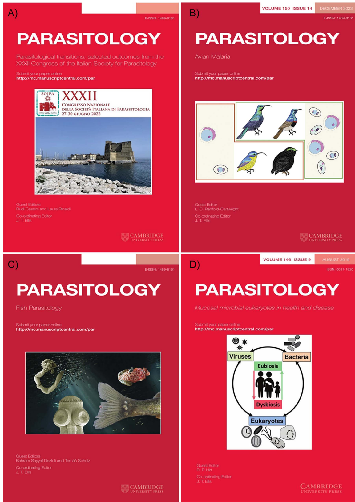
Figure 2. Front covers of four special issues: (A) XXXII congress of the Italian society for parasitology; (B) avian malaria; (C) fish parasitology; (D) mucosal microbial eukaryotes in health and disease.