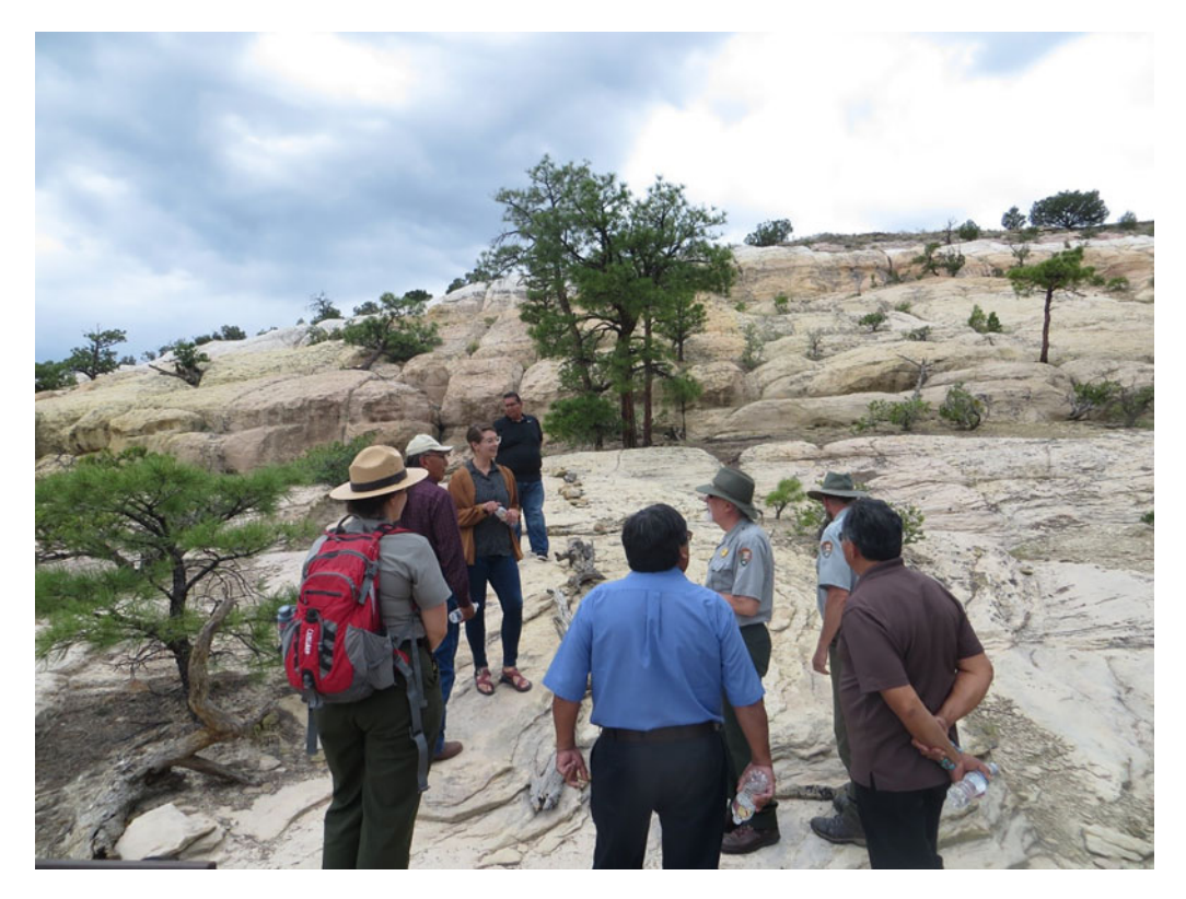
Figure 3. Tribal consultation meeting to review IRAD draft nomination on August 3, 2018. (Color online)

which these places are significant in terms of both scientific significance and ongoing social and cultural importance. Note that although some historic contexts may emphasize certain data types over others (i.e., archaeological, ethnographic, documentary), they all require the convergence of many lines of evidence. Further, most IRAD properties communicate multiple historic contexts. This demonstrates not only the utility but also the necessity of a layered approach to historic contexts.