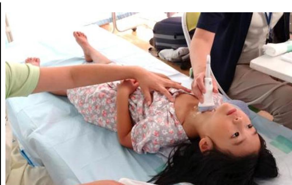
A thyroid test

On 9 October 2011, Fukushima Medical University (FMU) started a two-stage programme of thyroid cancer tests for 368,000 residents in Fukushima Prefecture who were aged 18 or under on 11 March 2011. The first stage was the 'Preliminary Baseline Survey' and began on residents in 'high exposure areas' and eventually covered all municipalities. The original plan had been to commence three years after the incident, but the testing was brought forward due to parental concerns. 1 In April 2014, FMU started the second stage 'Full Scale Survey' of 380,000 residents, now including those who were in utero on 11 March 2011. Participants are to be tested once every two years until they are 20 years old, and then every 5 years for the rest of their lives. The programme uses advanced ultrasound equipment and is unprecedented in scale. It is part of a wider Health Management Survey aimed at estimating the exposure levels and assessing the health status of all Fukushima residents, approximately 2 million people. The first case of thyroid cancer was reported on 12 September 2012 after 80,000 children had been tested. 2 Since then, the numbers have risen steadily. As of writing, 56 have been diagnosed with thyroid cancer, 1 with a benign tumour, and a further 47 are suspected of having the cancer. This brings the probable total to 103 out of 296,026 eligible residents examined. 3 Thus far, nearly all initially 'suspected' cancers have later been confirmed as malignant.