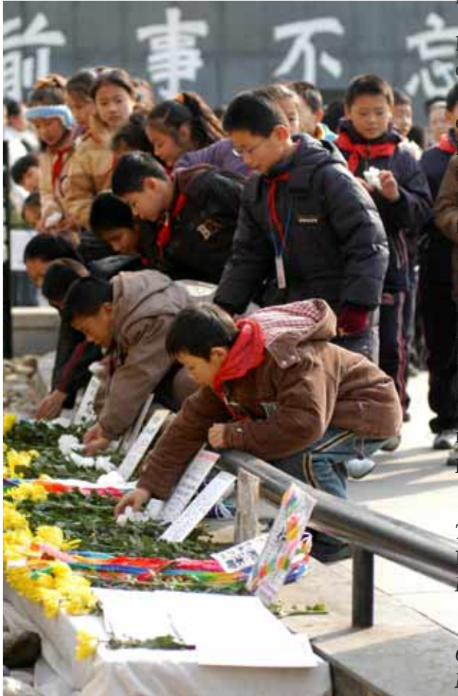
Chinese students place flowers in front of a monument for victims during a gathering marking the 68th anniversary of the Nanjing