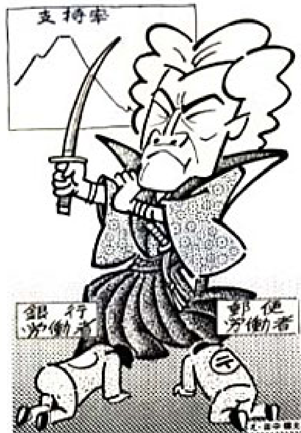
Koizumi and postal reform

tenure, especially in his last year in power. Yet he never suffered anything like Abe's crash. That's because Koizumi never lost control of the political process and appealed directly to voters with a clear and persuasive message about the need for reform. Koizumi famously declared that he was out to "destroy the LDP" and the traditional system of vested interests, which he assured voters would give a huge boost to Japan's efficiency and competitiveness. He cast the 2005 parliamentary election, for example, as a referendum on his campaign to privatize Japan's immense, state-run postal service (which includes the country's largest bank) in order to introduce market forces and break the power of corrupt officials. The public bought it, and Koizumi's team won a landslide, even winning over large numbers of unaffiliated voters.