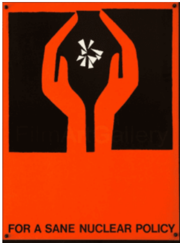
Handbill for original SANE group.

The new committee derives its name from the now-defunct National Committee for a SANE nuclear policy , an organization advocating for nuclear disarmament that was co-founded in 1957 by Norman Cousins, the editor of The Saturday Review who brought survivors of the atomic attacks on Hiroshima and Nagasaki to the U.S. for medical treatment.