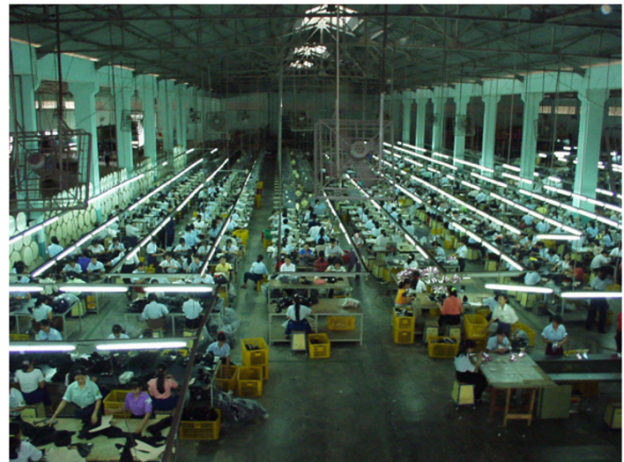
Women doing assembly work in a factory

There was a general sense that they provided some formal function, yet they did not provide any consistent sense of support in women's everyday working lives.