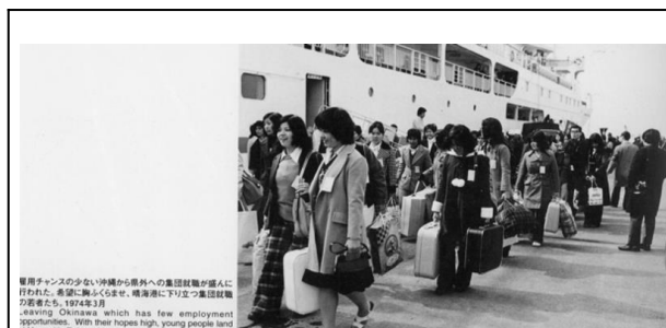
Young Okinawan workers arrive at Harumi

After travel restrictions ended with Okinawa's reversion to Japan in 1972, more people went to the mainland for work and study. Some settled there, but most returned to Okinawa even though it offered fewer employment opportunities. A survey conducted in 2000 estimated that 70,000 migrants and their descendants resided in Osaka Prefecture, mostly in Osaka City; 12,000 in Hyōgo Prefecture, mostly in Kobe and Amagasaki Cities; and 45,000 in Kanagawa Prefecture, mostly in Yokohama and Kawasaki Cities, for a combined figure of 127,000 in those three prefectures. While there is considerable movement back and forth, the total number of Okinawans currently residing on the mainland has been estimated at 300,000, between 20 and 25 percent of Okinawa Prefecture's 1.3 million population. 8 Although fewer now live in what have been called "ethnic communities," many maintain close connections with other Okinawans on the mainland. 9