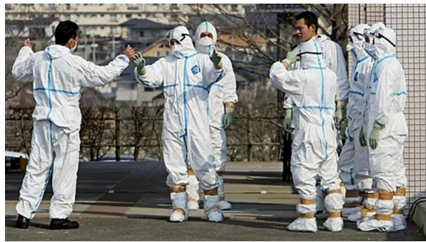
Workers at Fukushima Daiichi

The National Land Formation Plan, ratified by the cabinet in 2008, says: “Large cities and rural areas are mutually dependent in that the former lead the latter as headquarters providing urban functions, economic activities, and international exchanges, while the latter supply the former with personnel, food, water, energy, and so forth.” The position given to an area like Tōhoku is that of a supplier of food, work force, and electricity. Or, like Okinawa, it can host U.S. air bases. Such a structure can be said to have emerged out of the domestic division of labor in an era marked by total war and high-speed economic growth from the 1930s to the early 70s.