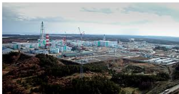
Rokkasho nuclear reprocessing plant

After the war, following the Comprehensive Land Development Law of 1950 and the Electric Power Development and Promotion Law of 1952, the electric power companies with regional monopoly cooperated with national policies to promote development of giant regional electric power sources. When selection of locations for nuclear power complexes began in the 1960s, places chosen from Tōhoku were Fukushima prefecture's coastal zone, which was poor enough to be called "Fukushima's Tibet," and Aomori prefecture's Rokkasho, which was a postwar settlement for repatriates from Manchuria. They had migrated to Manchuria in the period of economic crises in the 1930's under government policies which promoted the transfer of Japanese farmers to colonies and occupied areas.