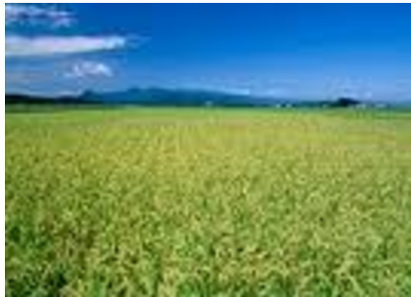
Rice fields, Miyagi

The food control system, which was carried into the postwar era, stimulated cultivators to produce rice. Even then, progress in rice production in Tōhoku was not so rapid. Yamagata prefecture's crop, making a "leap" to third place in the entire country around 1950, is said to have marked the beginning, but the crop in prefectures like Iwate and Miyagi was below the national average. It was only in 1990 that Akita, Yamagata, and Aomori occupied the top three places, with Iwate, Fukushima, and Miyagi ranking among the top ten.