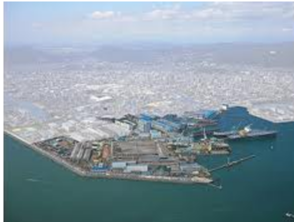
Mitsubishi Heavy Industries at Kōbe Harbor

The industrial structure of Kōbe around 1995, centering on ship building, steel manufacturing, and harbor business was the product of twentieth century Japan's industrial mapping, as was Tōhoku's rice production, parts manufacturing, and Kamaishi's steel manufacturing. When an area that has been hollowing out amid changes in industrial structure and international competition receives a blow from an earthquake, the slump of existing industries already underway is suddenly accelerated. The Kōbe economic slump was a result of this phenomenon.