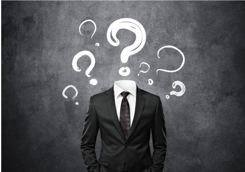
Figure 2. “Who is Satoshi Najamoto?”

tral banker.” 18 Likewise, one could say that with Bitcoin, the code is the central banker (fig. 3). 19