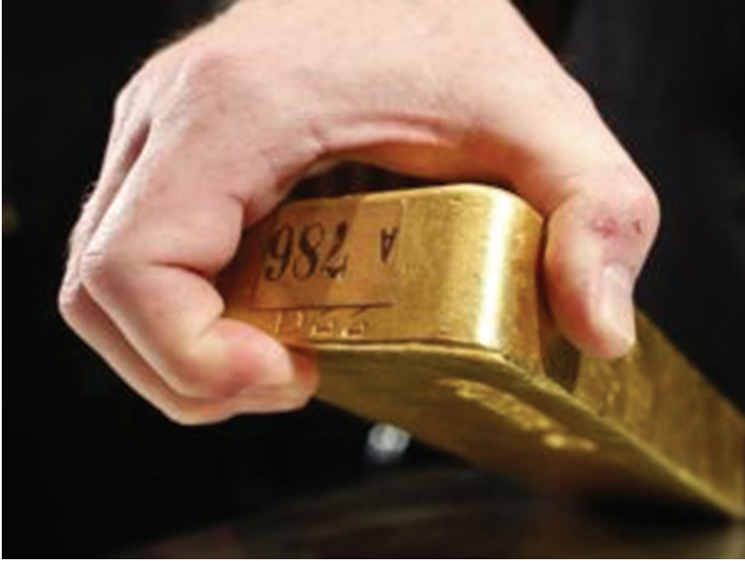
Figure 1. Deutsche Bundesbank.

sizing both weightiness and security. In some places, even gold's edibility is foregrounded, as in the analogies with toffee and chocolate. At the World Gold Council offices in New York, I was given a small jar of "edible gold petals." When they first produced this particular bit of swag, the official told me, they were required to put an expiration date on it. "It's a bit absurd," he said. "We put 2023, but we could just as easily have put 3023, because gold always stays the same." 14 Here, then, are key instances of my point concerning semiotic claims to immediacy—its value beyond or before semiosis—as these images and performances of "real" visible, tactile gold are themselves classic indexical signs that assert meaning on the basis of contiguity, while claiming themselves as intrinsic and nonsemiotic.