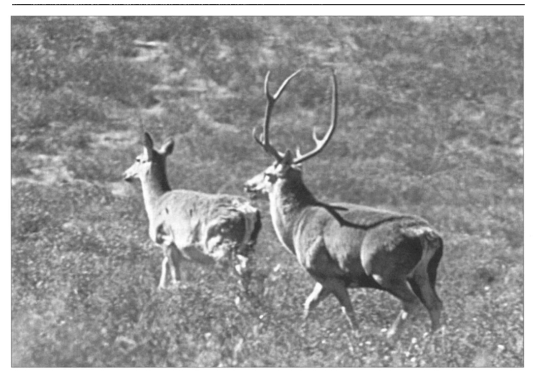
Adult male and female Tibet red deer, October 1995 (G. Schaller).

The Chumbi Valley, as it was once called, projects south between the Sikkim part of India and Bhutan. Tibet red deer once occurred on the eastern side of the valley bordering Bhutan. Waddell (1905) noted that the animals were present in 'considerable numbers' above 3000 m in the 'open forest of birch, rhododendron, juniper, and pine, broken at intervals by stretches of grassy downs'. Bailey (1911) found them 'very scarce' there, and in 1925 (Ludlow, 1959) saw three deer and thought that the valley contained only 'a few'. One of us (W.L.) surveyed wildlife in the Chumbi Valley in 1988 and was told that the last red deer were seen during the 1960s.