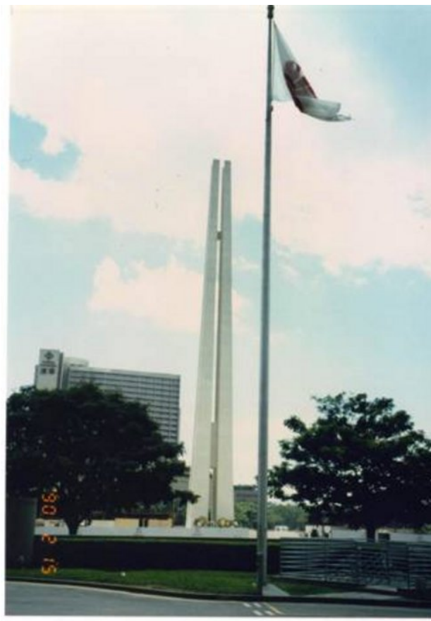
Civilian War Memorial in War Memorial Park, Singapore

the eight textbooks approved by the Ministry of Education in April 2005 for use from 2006, descriptions of Korean forced labor have all but disappeared, as has the term “comfort women”. Overall, references to Japanese aggression and atrocities have been drastically reduced under pressure from the Ministry of Education, the Liberal Democratic Party, and the right-leaning mass media. If the current ultra-nationalistic trend continues, it seems likely that even the few descriptions of the Singapore massacre that do exist will be eliminated.