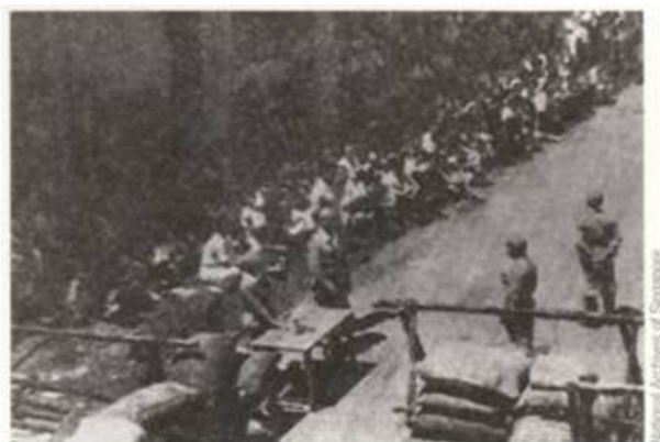
Chinese inspected by Kempeitai

Shortly after British forces surrendered in Singapore on 15 February 1942, the Japanese military began operation Kakyō Shukusei [a] or Dai Kenshō [b], known in the Chinese community of Singapore as the Sook Ching ("Purge") [c], in which many local Chinese were massacred.[1] Although the killings have been investigated extensively by scholars in Malaysia and Singapore, this article draws on Japanese sources to examine the events.