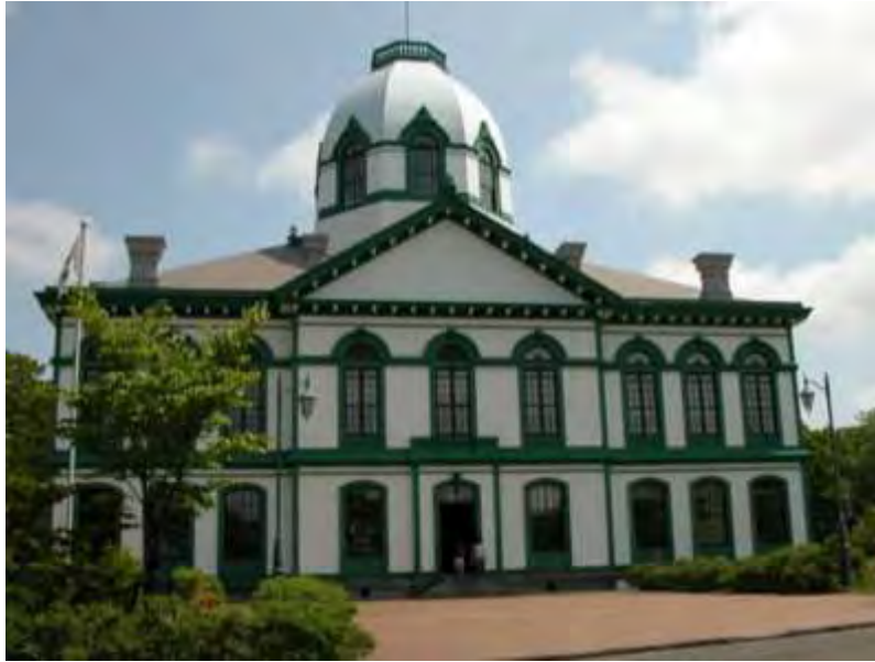
Hokkaidō colonial headquarters, Sapporo

The Imperial Will demanded a capital city for the newly named island. The Kaitakushi charged Shima Yoshitake, a former samurai of the Saga domain, with the design and construction of Sapporo. In surviving pictures, Shima is grave for the camera, the beard of a Chinese sage garnishes his chin, and in one, perhaps taken at the time he received honors from the Meiji emperor, he is dressed in the formal headgear and kimono of a senior feudal retainer.