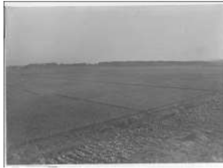
The geometry of rice cultivation, Hokkaidō 1909