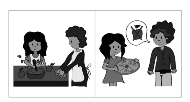
Figure 2. Mixed Faux Pas Story "Apple Pie".

Mixed faux pas story "Apple pie". Inés ayudó a su mamá a hacer un pastel de manzana para su tío, que vino a visitarlas. Ella lo llevó hasta su tío y le dijo: «Lo hice solo para ti». «Mmm», se le ve buena pinta... —respondió el tío Tomás, «Me encantan los pasteles, el único que no me gusta nada, nada, jes el de manzana!».