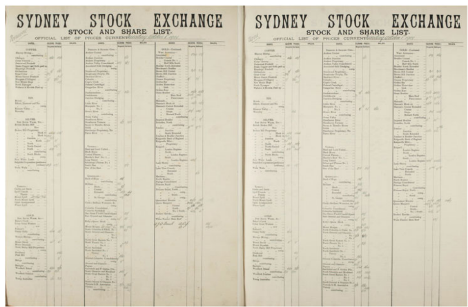
Figure A1. Sydney Stock Exchange stock and share list – official list of prices on Tuesday 1 October 1901