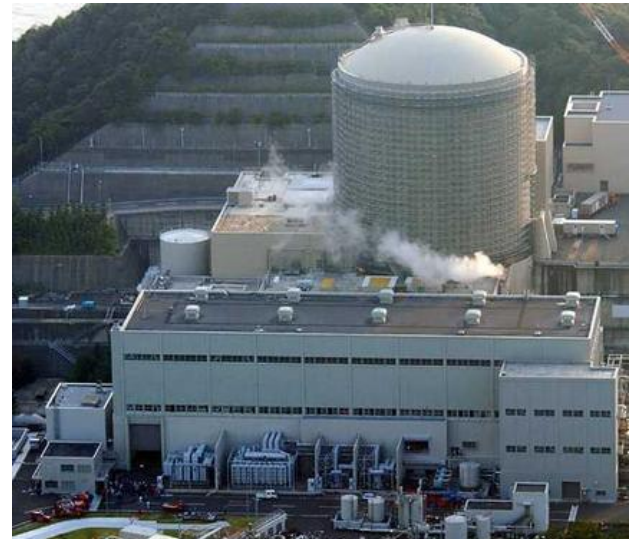
Steam billows from the Mihama nuclear power plant in a 2004 accident

The world has had to live for more than sixty years with the serious threat of nuclear devastation, a threat that is the result of the huge number of nuclear weapons that could destroy the earth several times over. Even as this danger continues, we also face rising nuclear proliferation threats caused by the diversion of peaceful nuclear programs to military use and withdrawals from international non-proliferation treaties and agreements, as well as the threats of nuclear terrorism and thefts of or illicit trade in nuclear materials by non-state actors.