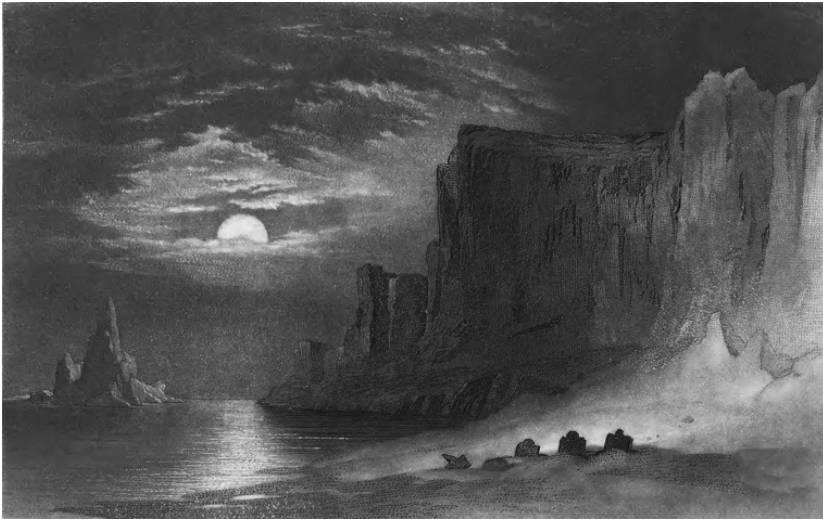
Figure 3.4 James Hamilton, after Elisha Kent Kane, Beechey Island – Franklin's First Winter Quarters, 1854. Mezzotint, 10.4 × 16.2 cm. Plate 4 of Kane, The U.S. Grinnell Expedition in Search of Sir John Franklin. A Personal Narrative (New York: Harper & Brothers, 1854). Public Domain.

of the search. 150 Over several years, Kane had been encouraged by his family to write up his escapades as a young doctor travelling the world, and by the time he went to the Arctic in 1850, he had become adept at turning any story into a thrilling adventure with a veneer of scientific authenticity. 151 This plate (Figure 3.4) was one of those engraved by the notable mezzotint engraver John Sartain from drawings by James Hamilton. The subtitle is careful to include the words 'after a sketch by Dr E K Kane', conferring authority on the depiction. Entitled Beechey Island–Franklin's First Winter Quarters , the caption fails to refer to the graves. However, the silhouetted grave markers are dramatically backlit and clearly are the focus of the picture, lending a ghostly atmosphere to the scene. The half-concealed moon adds a sense of mystery, and the peaks of an iceberg on the horizon recall gothic edifices.