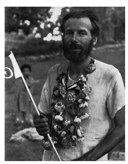
FIGURE 2 Arne Næss on vacation with the Norwegian Alpine Club in Pakistan, 1950.

however, climbing was the all-dominating focus, besides participating in polo matches organized by local officials who went out their way to entertain the Norwegian tourists. In 1964 they repeated the success with another climbing vacation to Tirich Mir, which resulted in a book-length account of the achievement written by Næss. In it he would explain his ability to thrive as a technical climber as a mixture of pain and excitement in mathematical terms as T = G^2/(L_S + \mathring{A}_s) where T trivsel (thriving) equaled G^2 glød i annen potens (excitement squared) divided by L_S legemlige smerter (bodily pains) plus \mathring{A}_S åndelige smerter (spiritual pains). The formula would later reemerge in his deep ecology inspired Ecosophy T, with the "T" being short for "thriving."