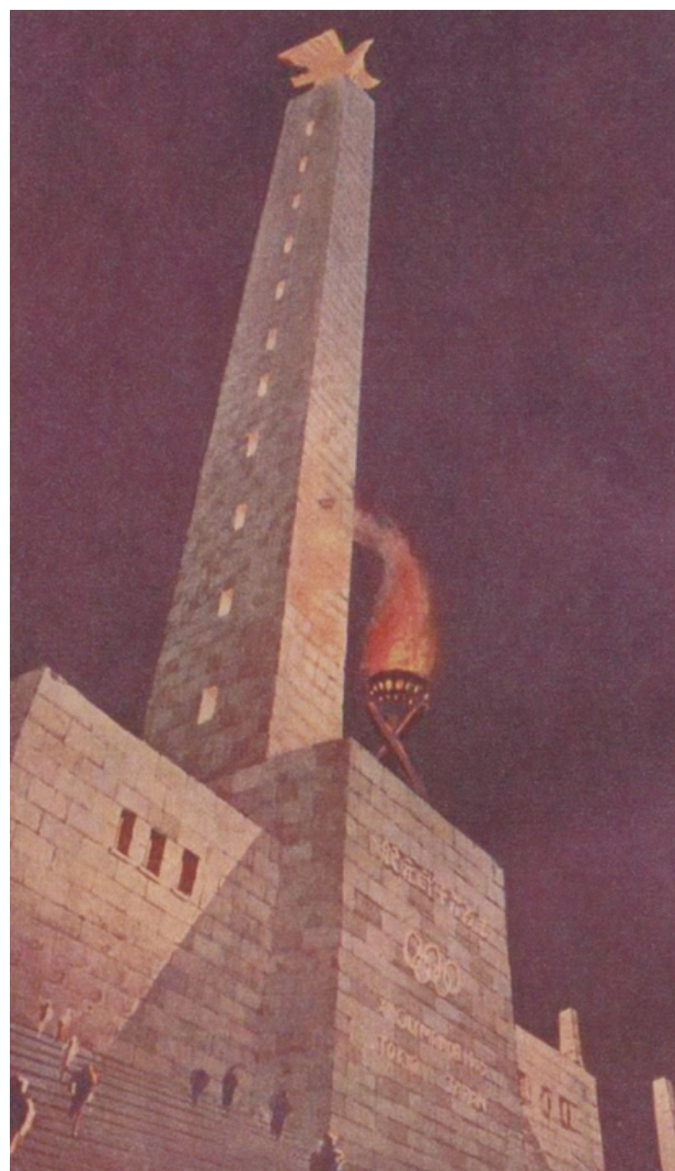
Artist's conception of a tower, planned for Komazawa Olympic Park but never built. A more modest structure remains there from the 1964 games.

anniversary of Jimmu's ascension, never got past the blueprint stage. The land was eventually utilized for the 1964 games, and still functions as a public park and for holding various sporting events.