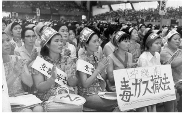
Poisoned ties: Okinawan women hold placard reading "Remove poison gas from Okinawa" at a Japan Mothers Association meeting in 1969 in Tokyo, just weeks after a poison gas accident at a U.S. installation on the island.

In 1961, as the Cold War deepened, the U.S. initiated a comprehensive overhaul of its defensive capabilities in more than 100 different categories; No. 112 on this list was the study of CBW. Envisaged by President John F. Kennedy's secretary of defense, Robert McNamara, as "an alternative to nuclear weapons," Project 112 proposed experiments in "tropical climates" and, to evade laws regulating human testing in the U.S., it suggested the use of overseas "satellite sites." 9 Fulfilling both prerequisites, Okinawa must have seemed a perfect choice. In particular, the Northern Training Area in the island's Yanbaru jungles must have been a particularly tempting target for U.S. scientists since it was (and continues to be) the Pentagon's prime tropical guerrilla training center.