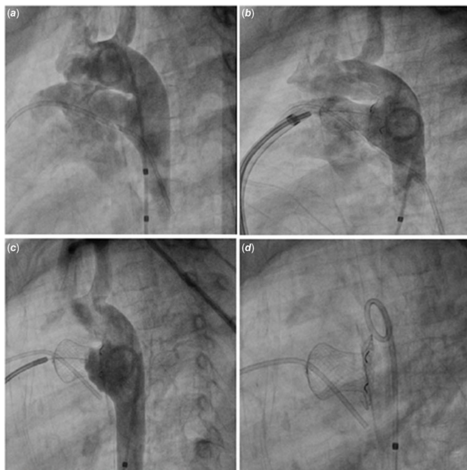
Figure 1. Images of the cardiac catheterization procedure. (a) Angiogram demonstrating the ductus arteriosus. (b) Placement of the device in the ductus arteriosus. (c) Angiogram after 30 minutes of test occlusion and hyperoxia, device still attached. (d) The device after release.

Temporary occlusion of the ductus arteriosus, generally with a balloon catheter, allows the acute evaluation of its effect on pulmonary arterial pressure, particularly in borderline cases. 7 The use of an interventional device instead of a balloon for temporary